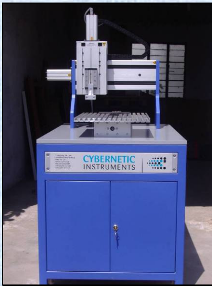
XYZ Table Type 4B