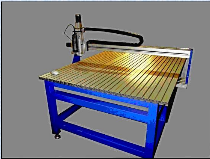
XYZ Table Type 2G