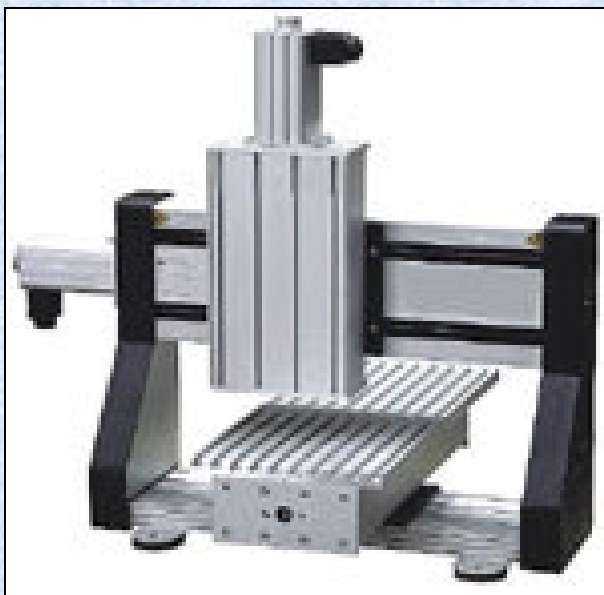
XYZ Table Type 3B