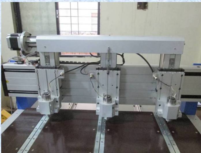
XYZ Table Type 5B

Video Demo: http://www.youtube.com/watch?v=J_Ick_q9Oyc