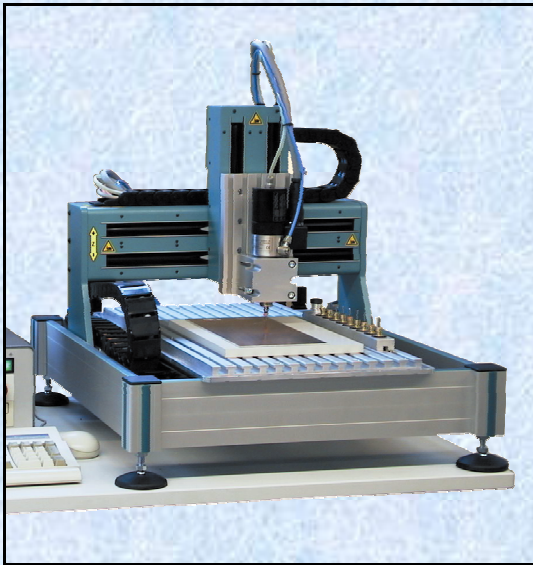
XYZ Table type 1G