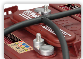
Clamless tubing (available for customizable configurations)

Trojan batteries are available worldwide through Trojan's Master Distributor Network. We offer outstanding technical support, provided by full-time application engineers.