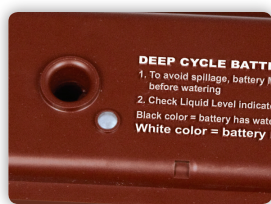
Optical water indicator signal