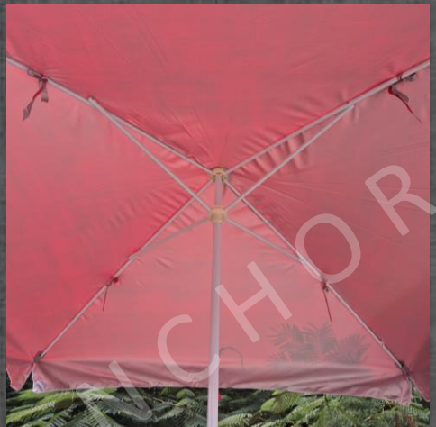
Heavy Duty Channel Construction