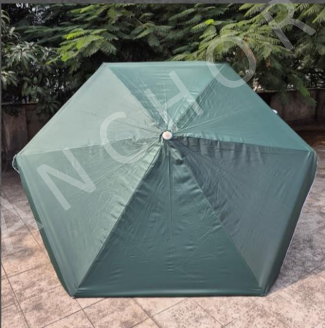
Hexagon Shape For a Fresh Look