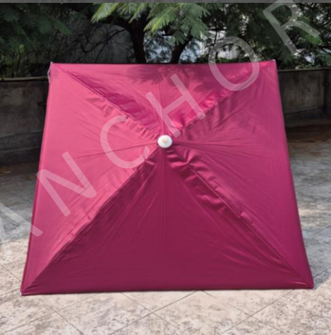
Classic Square Shape For a Clean Look