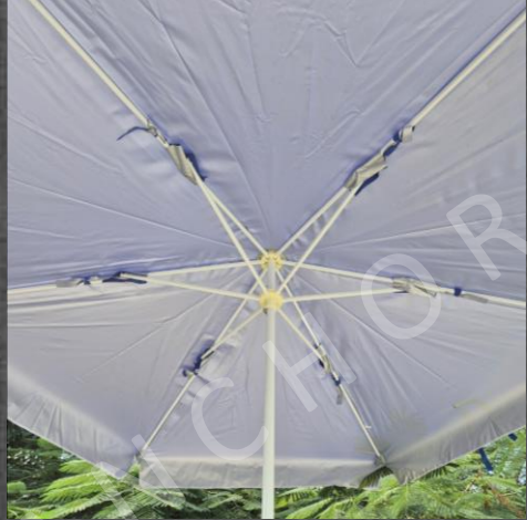
Heavy Duty Channel Construction