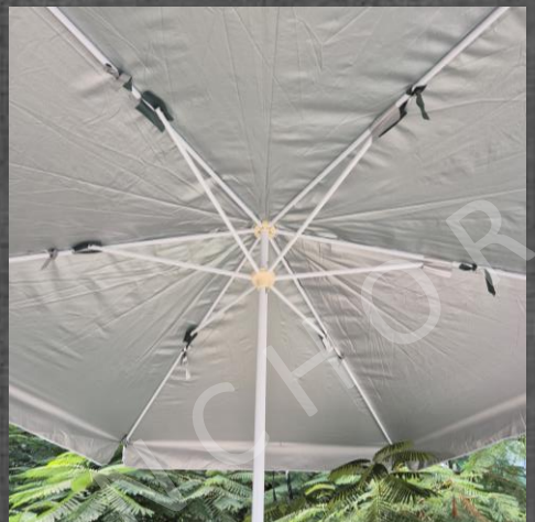
Heavy Duty Channel Construction