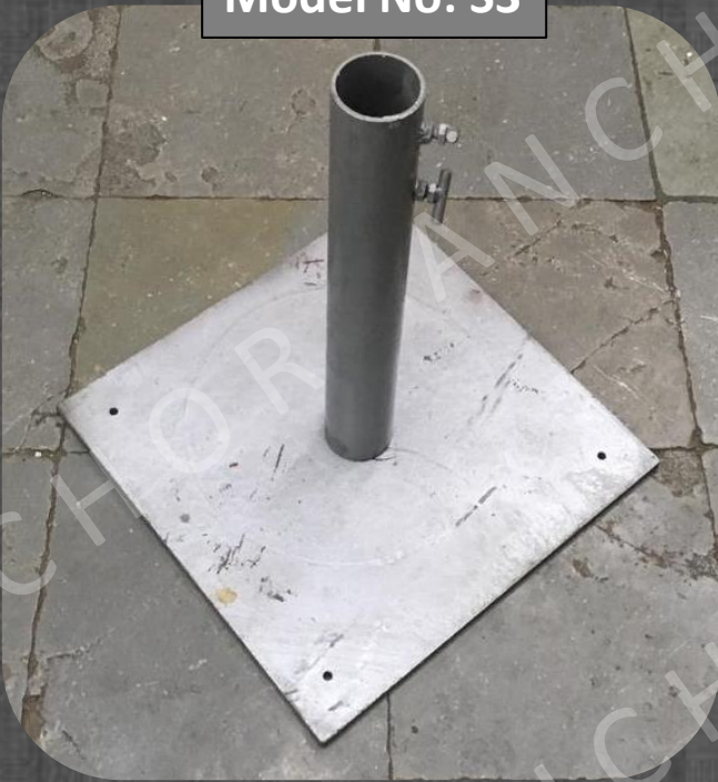
Economy Welded Plate Stand