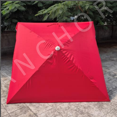
Classic Square Shape For a Clean Look