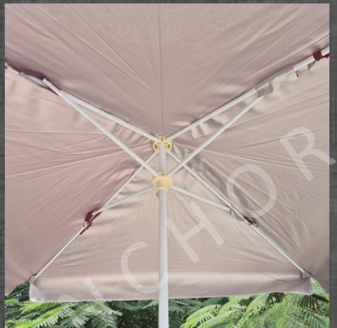
Heavy Duty Channel Construction