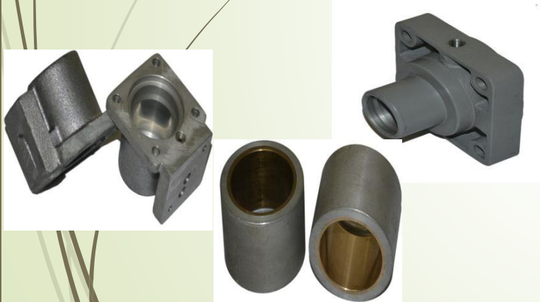
❖ PNEUMATIC VALVES.