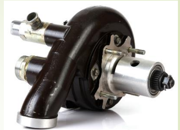
UTD Water Pump