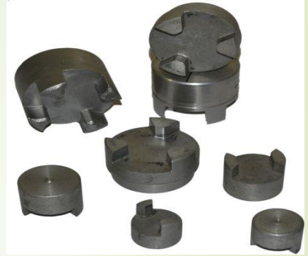
❖ COUPLING CASTINGS