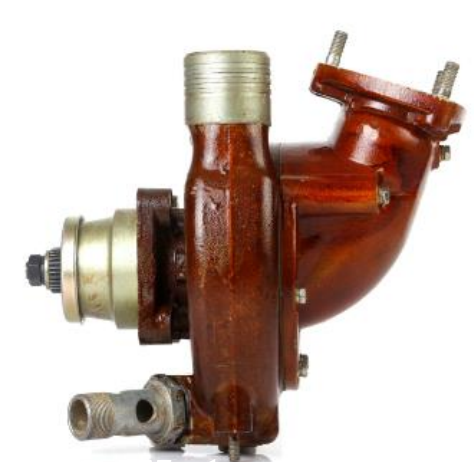
T90 Water Pump