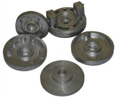
❖ DC MOTOR PARTS