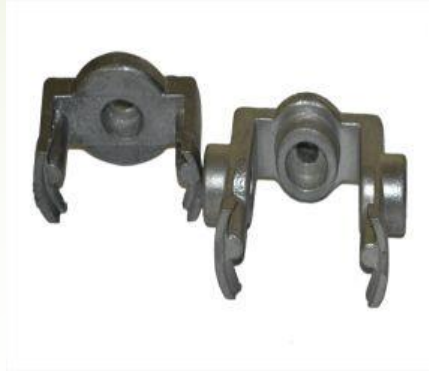
❖ MOTOR FLANGES