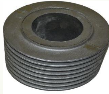
❖ CYLINDER BLOCK CASTINGS