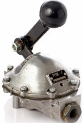
Hand Fuel Pump