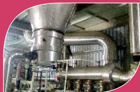
Integrated Fluid Bed Dryers (IFBD)