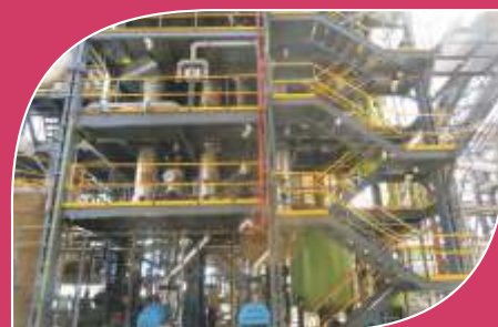
Multi Effect Evaporator Plant (MEE)