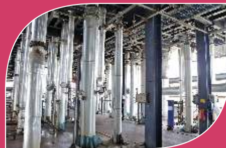
KLAREN Self-cleaning Evaporator, Netherlands