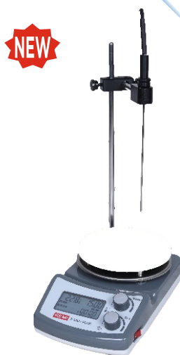
3 MLH Plus