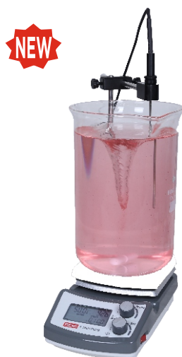
6 MLH Plus