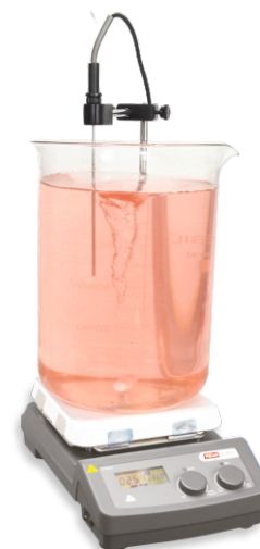
10 MLH Plus

Remi presents the next generation of magnetic stirrers with new stir technology and hot plates to use in temperature up to 550°C.