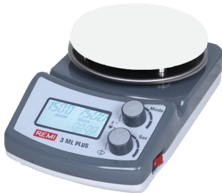
3 ML Plus