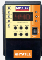
PR 20 Digital

For 3 \phi DOL & Star Delta Pumpset Three Phase Dryrun Autoswitch Controller