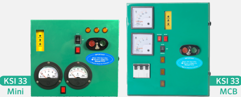
KSI 33 Mini

For 3 \phi DOL Pumpset Three Phase DOL Controller