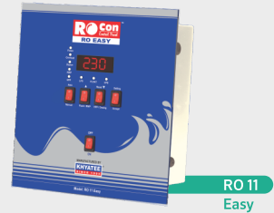
RO 11 Easy

For Industrial / Commercial RO Plants Automatic RO Controller