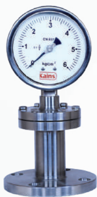
1 section Flange Diaphragm