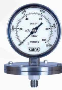
Schaffer Diaphragm Gauge