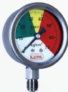
Customized Dial Gauge