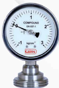
Union Nut Diaphragm