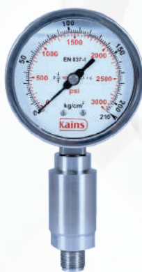
High Pressure Diaphragm