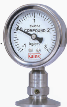
Tri Clover Diaphragm