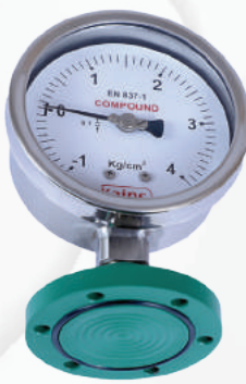
PTFE Coated Diaphragm