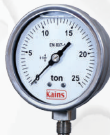
Load Pressure Gauge