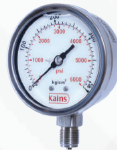
Glycerine Filled Pressure Gauge