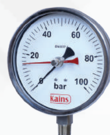
Pressure Gauge with Follower Pointer (MRP)