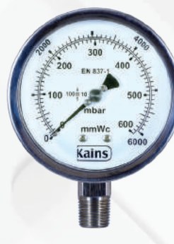
In-Built Capsule Diaphragm