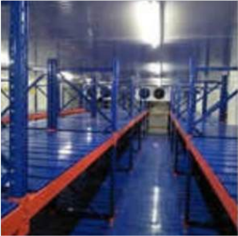
Commercial Cold Storage