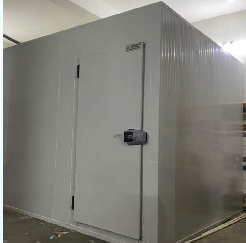
Modular Cold Room