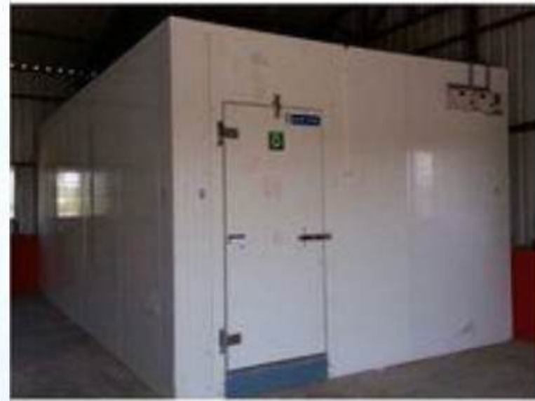
Walk In Chiller Room