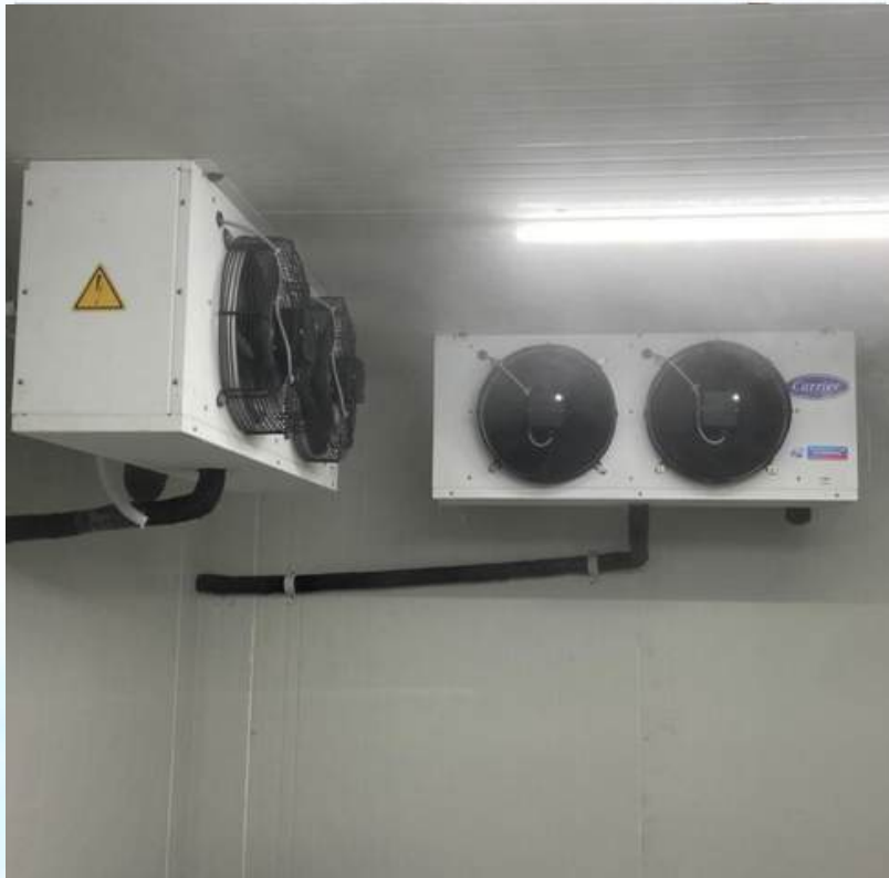
Ice Cream Cold Room