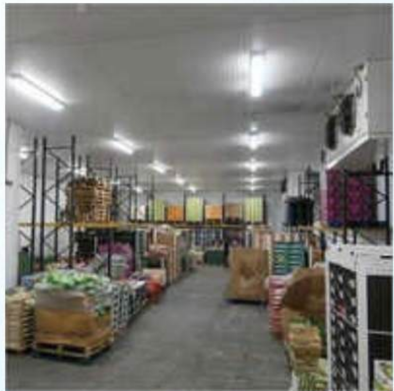
Blue Star Cold Storage Room