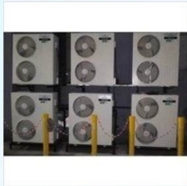
Cold Room Outdoor Unit