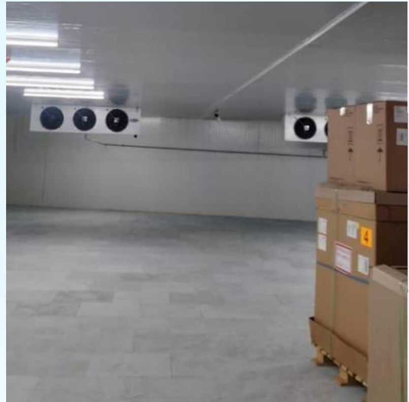
Multipurpose Cold Storage