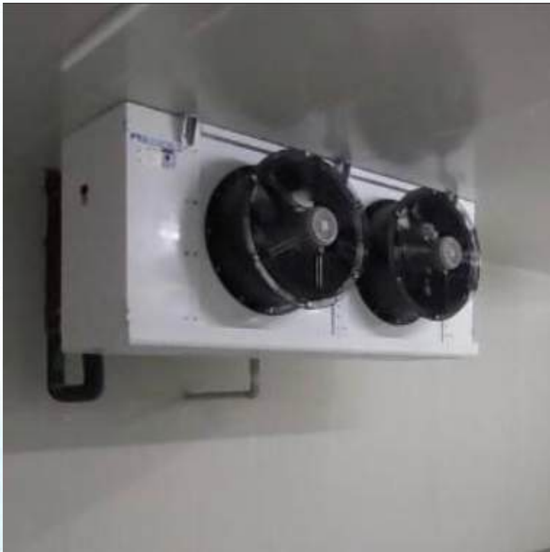
Automatic Cold Storage Room