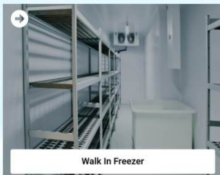
Walk In Freezer