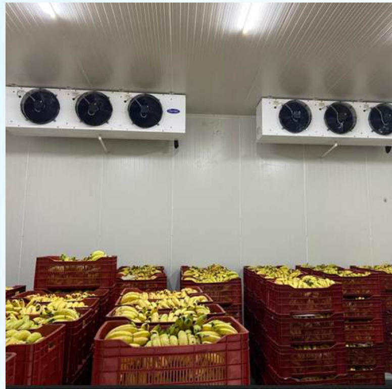
Banana Ripening Chambers

📍 21/15, Block-21, Ground Floor, Near Jawala Mata Mandir, Moti Nagar, New Delhi - 110015