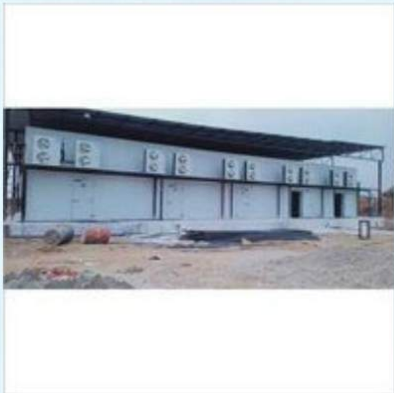
Mushroom Cold Storage Plant