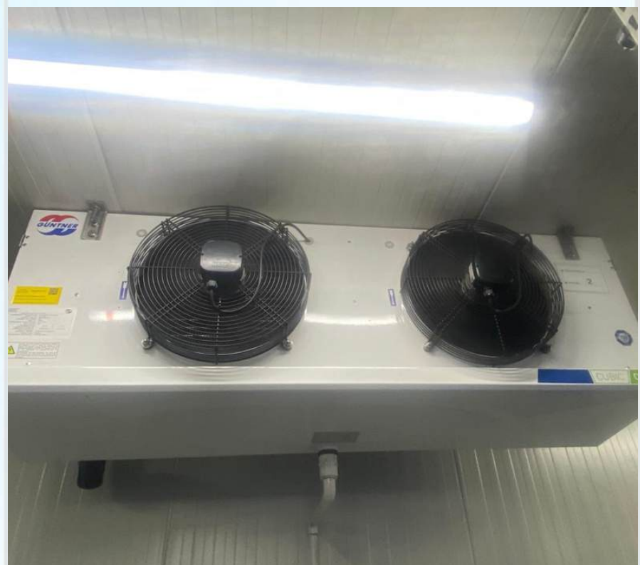
Evaporator unit cold storage