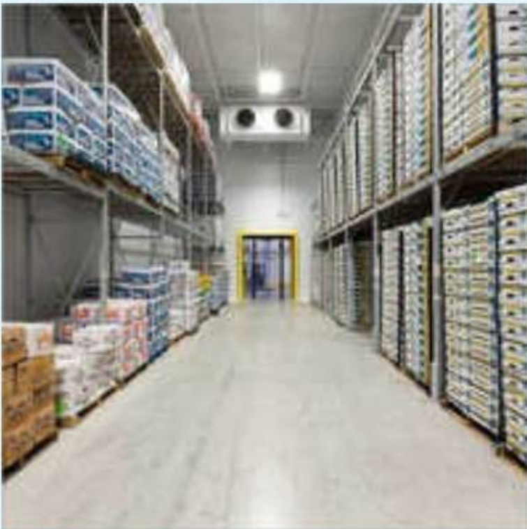
Industrial Cold Storage Room