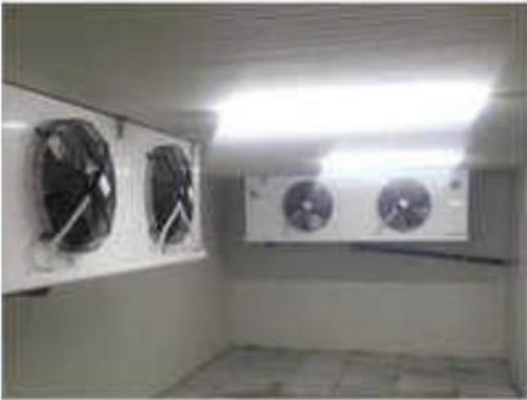
Walk In Freezer