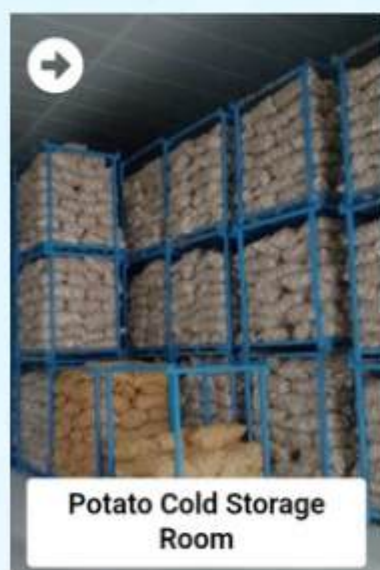
Potato Cold Storage Room

To guarantee the highest quality of products such as Cold Storage Room, Cold Room, Pre Fabricated Walk In Freezer, and more, each product undergoes rigorous testing and is closely monitored to ensure optimal performance, all while adhering to the latest industry standards by our experienced quality experts.