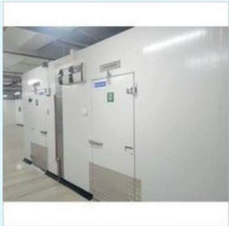
PUF Panel Cold Room