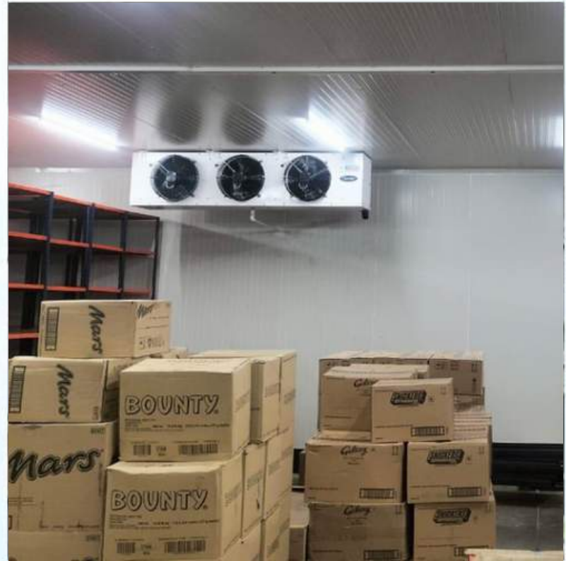
Carrier Cold Storage