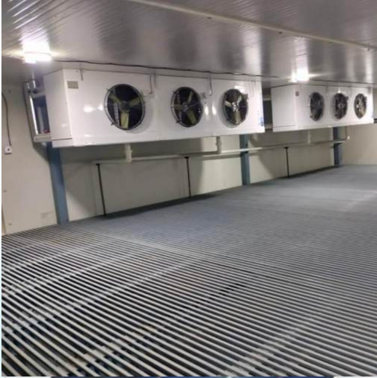
Potato Commercial Cold Storage