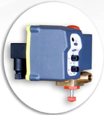
Optional - Auto drain Valve