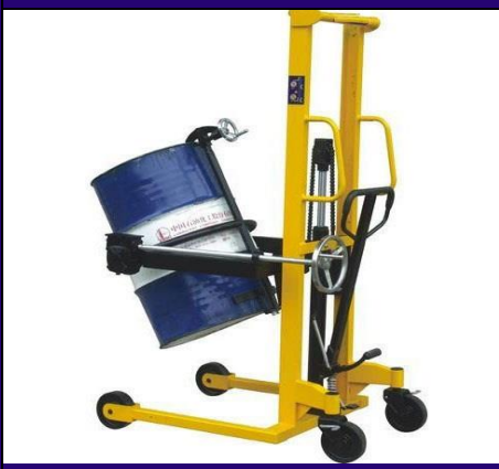
Drum stacker Capacity: 0.5 T to 1 T Height: 1.6, 2.0 mtr