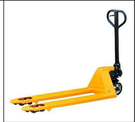
Hydraulic Hand Pallet Trolley Capacity: 2.0 T