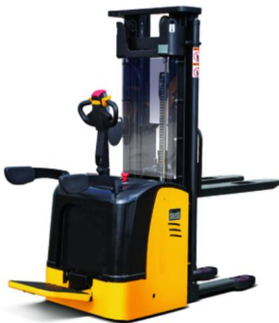
Electric Stacker Capacity : 1.5 T to 2.0 T Height : 1.6m to 6m