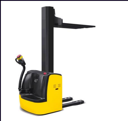
Pedestrian Electric Stacker