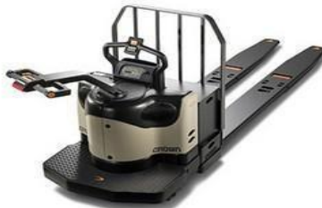
Battery operated pallet truck