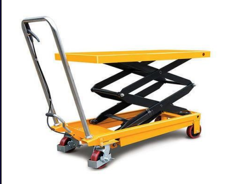
Manual Scissor Table