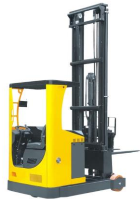
Reach Truck Capacity: 1.4 T to 2.5 T Height: 12m