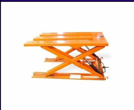
Floor mounted Scissor lift