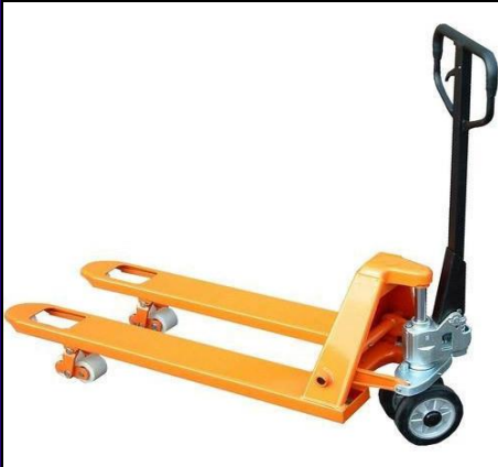
Hand Pallet Trolley Capacity: 2.5 to 5.0 T