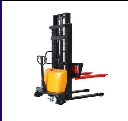
Side on Semi electric stacker