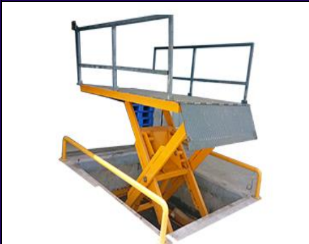
Pit Mounted Scissor lift