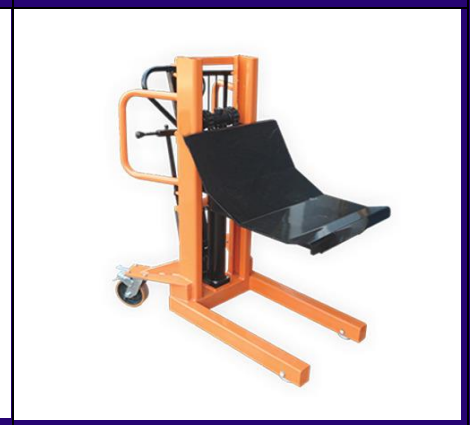
Reel stacker Capacity: 1.0 T to 1.5 T, 2.0 T Height: 1.6, 2.0 mtr