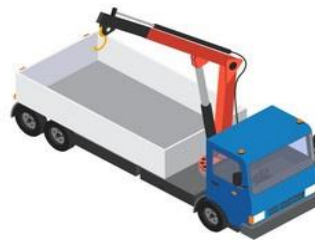
3 Sider Open Truck