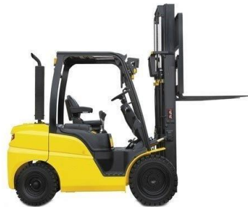
Diesel forklift Capacity: 1.5 T to 25 T Height: 6m, 7m .8m