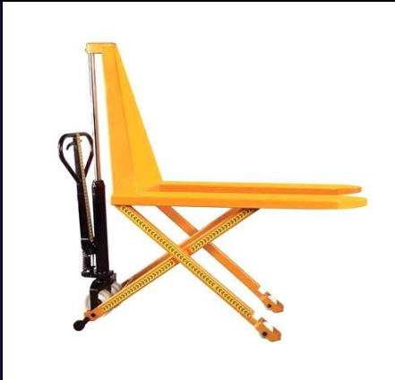
High – lift hand pallet trolley Capacity: 1.0 T Length – 800 MM