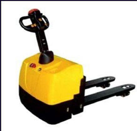
Battery operated pallet truck