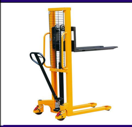
Hand stacker Capacity: 1.0 T to 1.5 T, 2.0 T Height: 1.6, 2.0 mtr