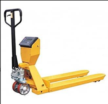
Weighing Hand Pallet Trolley Capacity: 2.0 T