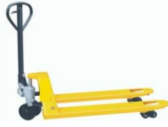
Hand pallet trolley