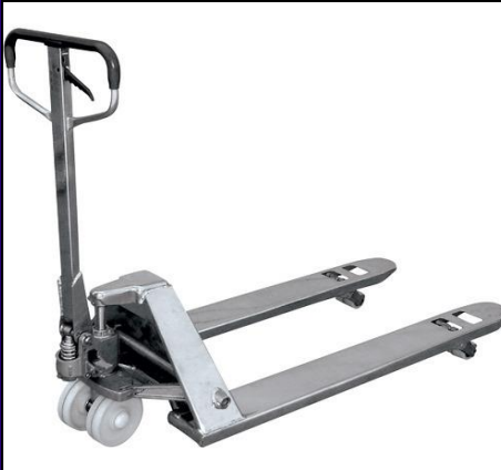
SS Hand Pallet Trolley Capacity: 2.0 T