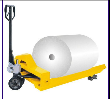
Reel Hand Pallet Trolley Capacity: 2.5 to 5.0 T