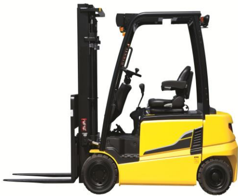
Battery forklift Capacity: 1.5 T to 5.0 T Height: 6m, 7m,