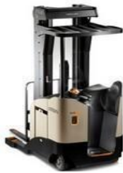
Battery operated order picker