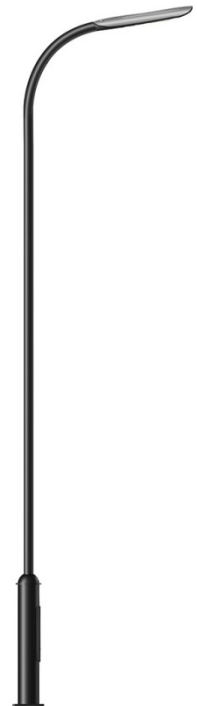
Cobra Rana Series