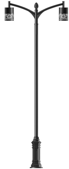
Eagle Mini Causeway Midi Series