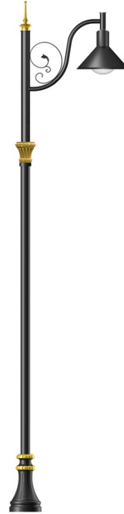
Curvy Bishop Series