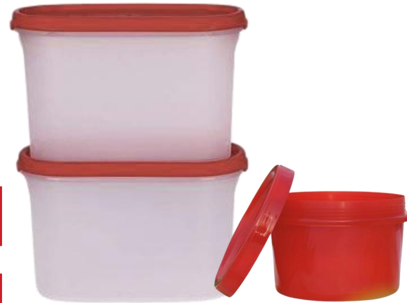
Jar with Lid