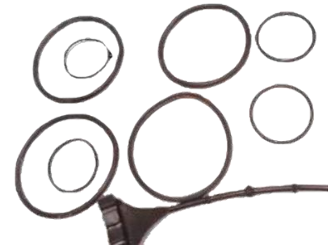
Rubber 'O' Ring