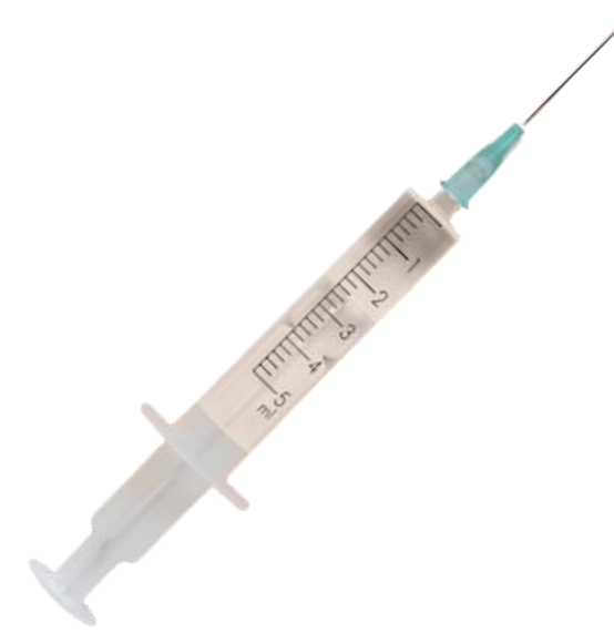
Syringe & Plunger