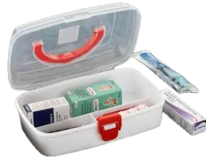
First - Aid Kit