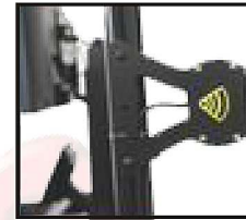
Ultrasonic Sonar Sensor