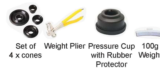
Set of 4 x cones Weight Plier Pressure Cup with Rubber Protector 100g Weight