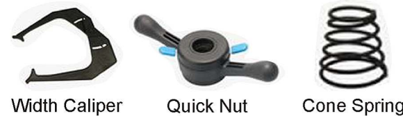
Width Caliper Quick Nut Cone Spring