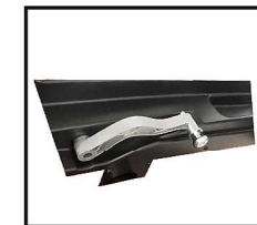
Aluminum alloy handle