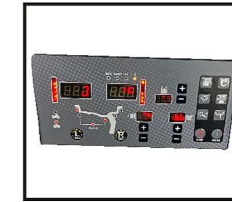
Control panel B70i