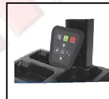
Control panel B980vi