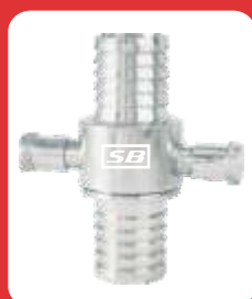
Instantaneous Hose Coupling