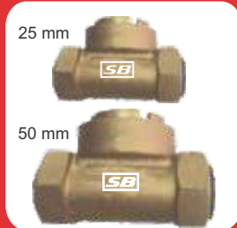
Water / Window Curtain Nozzle