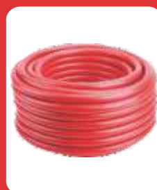
Thermoplastic Hoses for Hose Reels

Performance : Hydraulic Test 21 kgf/cm 2