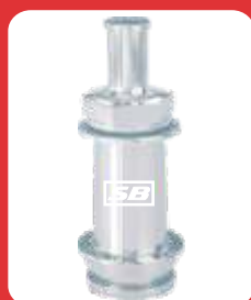
Short Branch Pipe With Nozzle