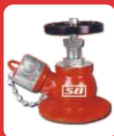
Landing Valve Single & Double Outlet