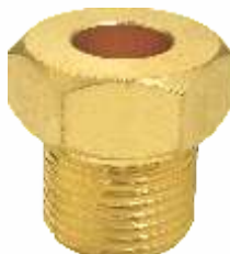
CYLINDER NUT 80 GM