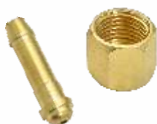
1/4 NUT NIPPLE SET