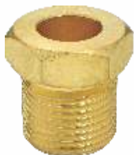
CYLINDER NUT 58 GM