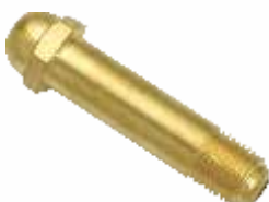
OXY. BULL NOSE