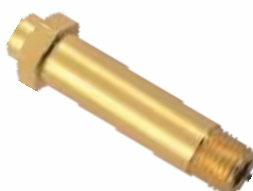
CO2 BULL NOSE