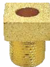
CYLINDER NUT 100 GM