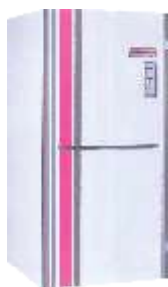
Retarder proovers for Trolley