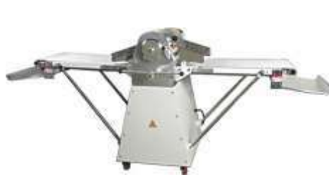
Floor Standing Dough Sheeter