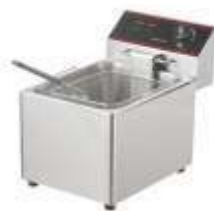
Electric Single Deep Fryer