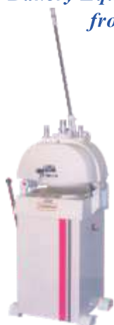
Bun Divider and Rounder