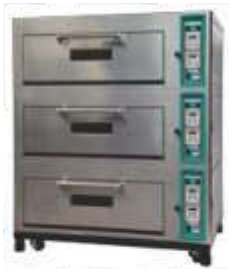
Gas / Electric Deck Oven

Customers' satisfaction, quality request is promise of BERJAYA fro serving the customers.