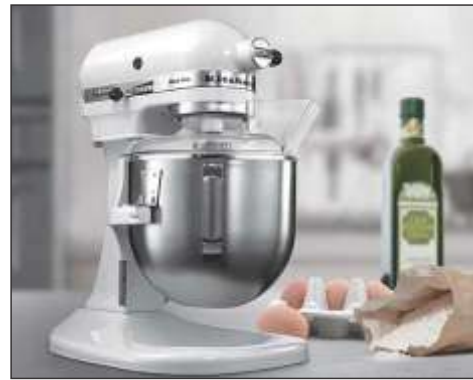
4.8 L BOWL-LIFT STAND MIXER