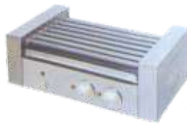
Hot Dog Roller