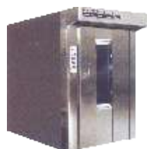
Rotary Rack Ovens