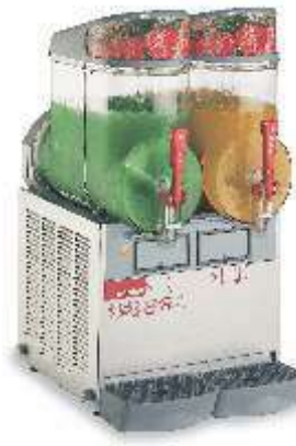
MT 2 GL