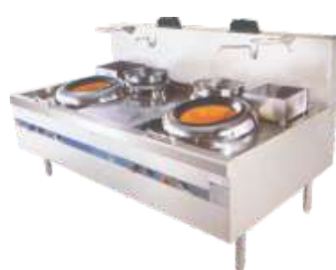
Chinese Cooking Range