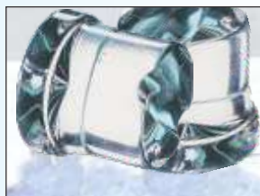
Gourmet Ice Cubes