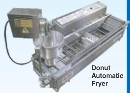
Donut Automatic Fryer

This versatile combination enables bakeries and others to fry cake and raised donuts in less than 3 feet (1m) of counter space up to 35 dozen donuts per hour, ideal for fast production during slack periods. Using Belshaw's full-featured Type 'N' Donut Depositor, it can make multiple varieties of cake donuts with Belshaw plungers and attachments.