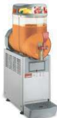
MT 1 Mini