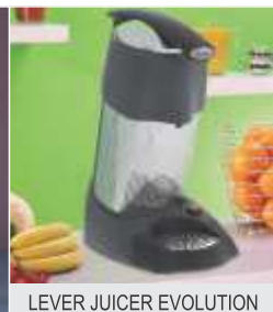
LEVER JUICER EVOLUTION