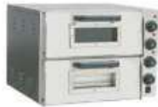
Stone Deck Oven