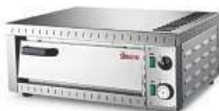
Stone Pizza Oven