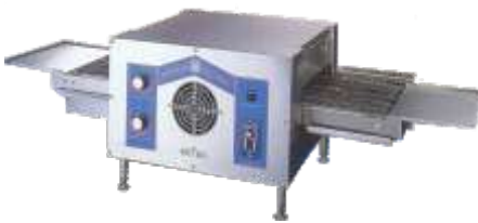
Electric Pizza Conveyor Oven