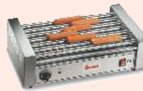
Hot Dog Roller