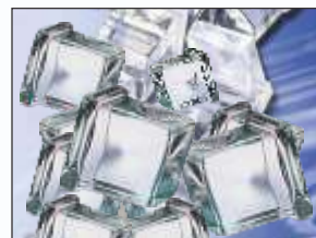
Full Dice & Half Dice Cubes