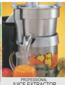
PROFESSIONAL JUICE EXTRACTOR