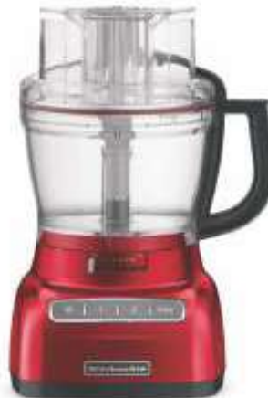
CUP FOOD PROCESSOR