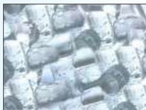
Nugget and Cubelet Ice