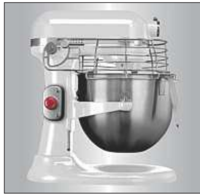
PROFESSIONAL BOWL-LIFT STAND MIXER