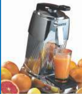
AUTOMATIC CITRUS JUICER