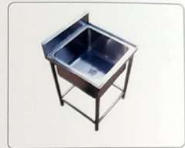
Single Sink Unit