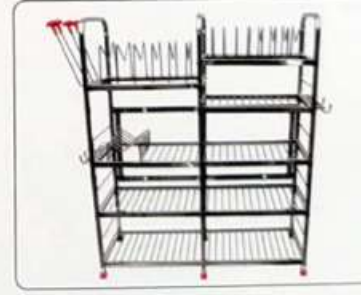
SS Plate Rack