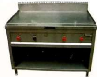
Hot Plate for Dosa / Chapatahi LPG / Electrical