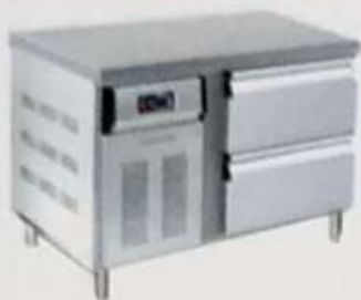
Two Drawer Work top Chiller