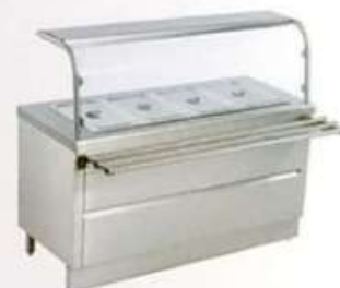
Bain Mari Counter with Glass