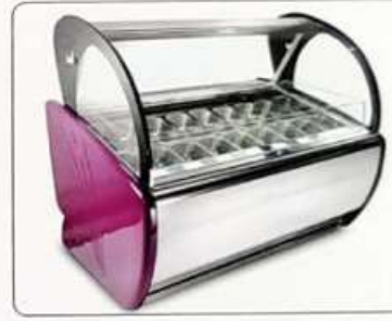
Ice Cream Display Counter