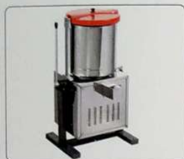
Wet Grinder Tilting