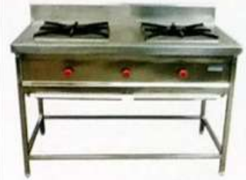
Double Burner Cooking Range