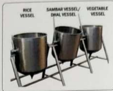
Rice Cooking Vessels