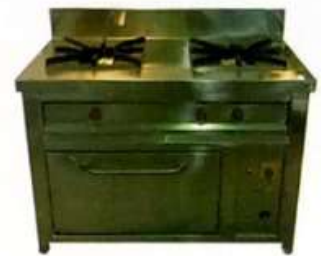
Two Burner Continental Range with Oven Below