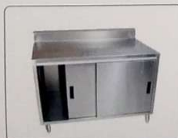
Work Table With Under Counter Storage