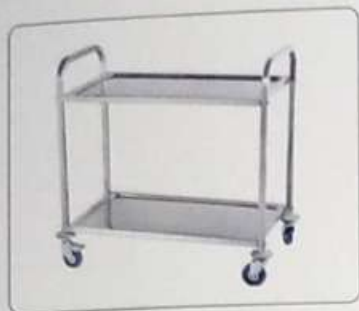
Utility trolley - 2 tier