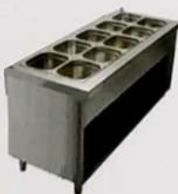
Round Bain Marie