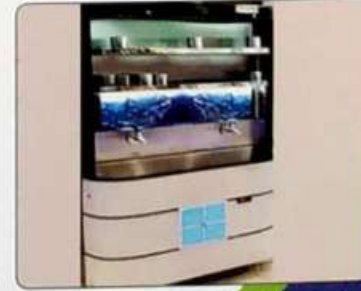
Combo Water Cooler