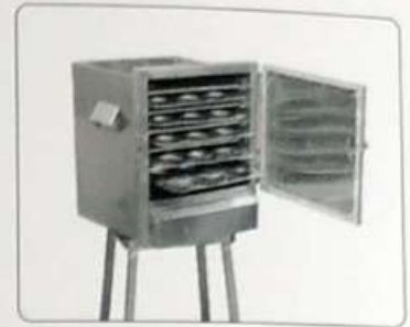
Idly Box - LPG