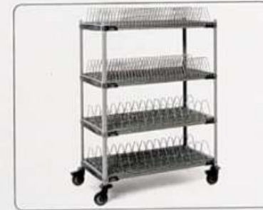
Mobile Plate Storage Rack