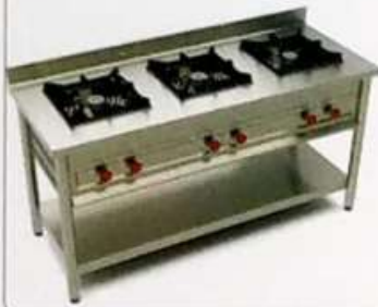
Three Burner Cooking Range