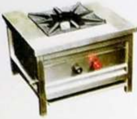
Bulk Cooking Range