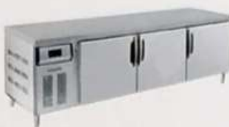
Three door work top chiller / Freezer