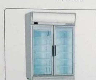
Double Glass Door Chiller