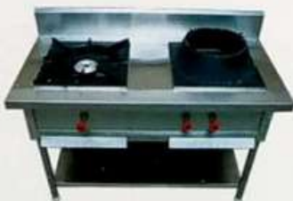
Indian & Chinese Burner Range