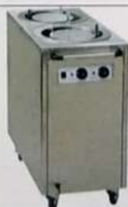
Plate warmer - Double