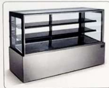
Straight glass display counter