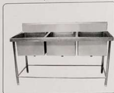
Three sink Dish Wash Unit