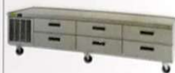
Six Drawer work top chiller