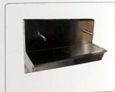
Hand Wash Sink