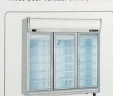
Three Glass Door Chiller