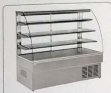
Hot case display counters