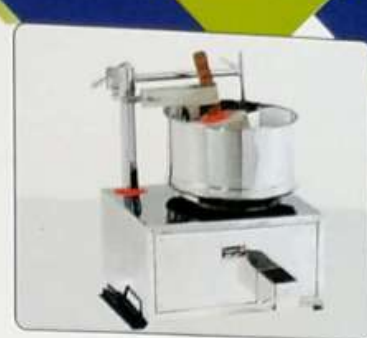
Wet Grinder Conventional