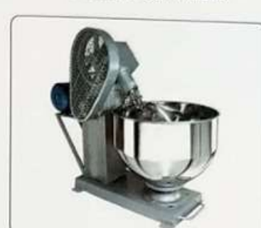
Dough Kneader Indian Make