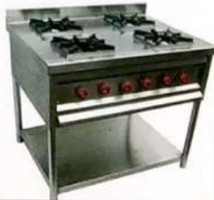
Four Burner Cooking Range