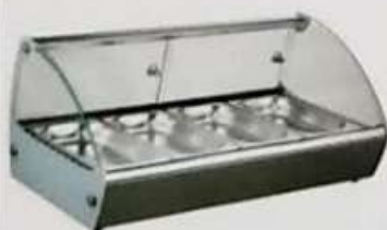
Hot Display warmer