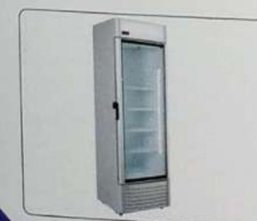
Single Glass Door Chiller