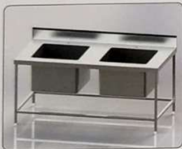
Two Sink Pot wash unit