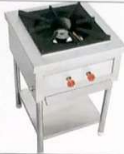
Single Burner Cooking Range