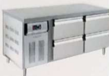
Four Drawer work top chiller