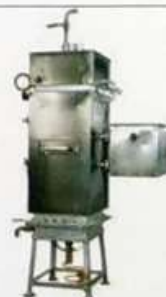
Steam Boiler Lpg / Electric / Firewood