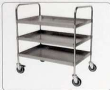
Utility Trolley - 3 tier