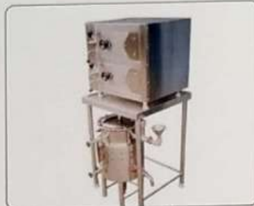
Idly Box with Baby Steam Boiler