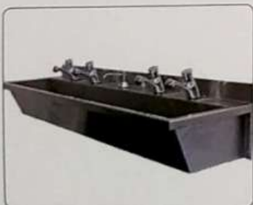
SS Hand Wash Sink Unit