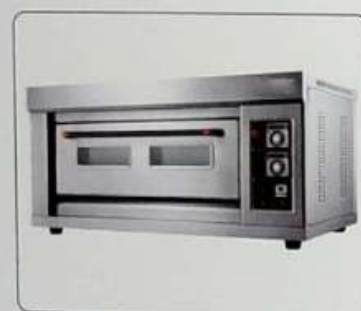
Pizza Oven Imported LPG & Electric