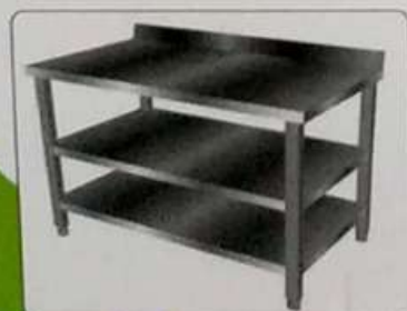
Work Table With 2 Under Shelves