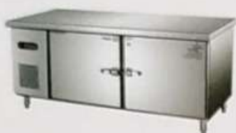
Two door work top chiller / Freezer