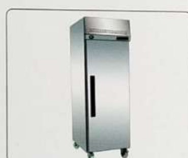
Single Door Vertical Chiller/ Freezer