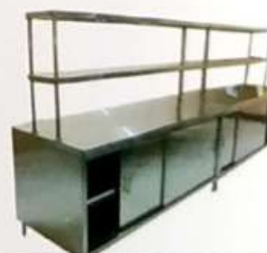
Food Pick up counter