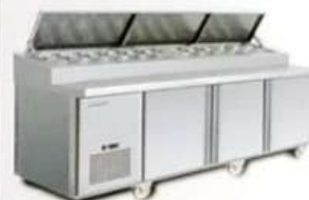
Pizza Counter with Chiller