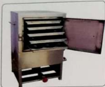
Idly Box - Electric