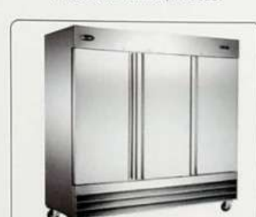
Three Door Vertical Chiller/ Freezer