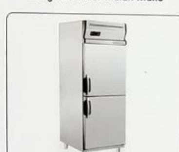
Two Door Chiller/ Freezer