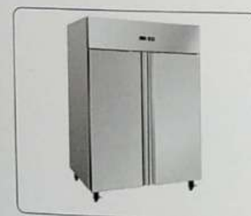
Two Door Vertical Chiller/ Freezer