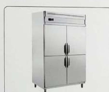
Four Door Chiller/ Freezer