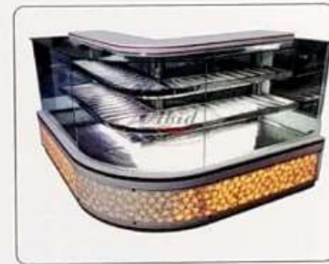
L Shape Display Counter