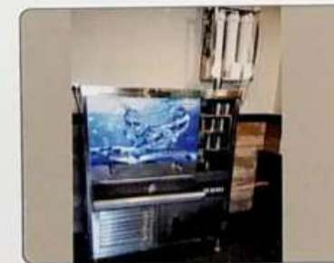
Purifier Water Tank