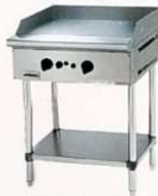
Griddle Plate Stand Alone