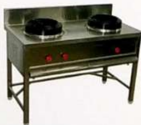
Two Burner Chinese Range