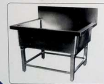
Pot Wash Sink