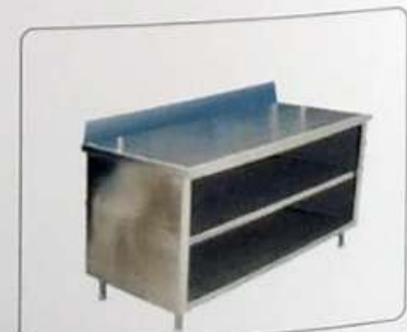
Pick Up Counter