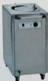
Plate warmer - single