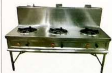
Three Burner Chinese Range