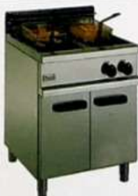
Deep Fat Fryer LPG & Electric