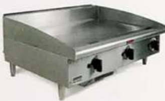
Griddle Plate Table Top