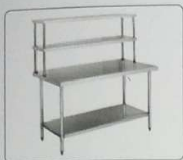
Work table with 1 us to 2 DHS