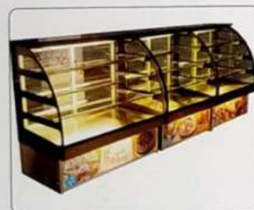
Bend Glass Display Counter