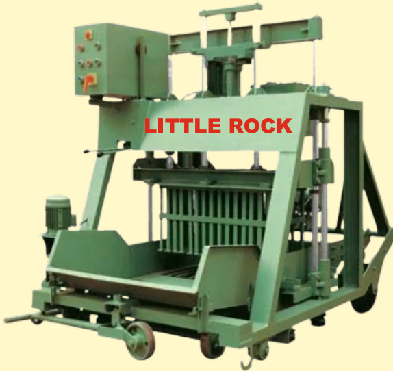
Hydraulic Concrete Block Making Machine