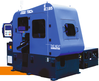
Circular Saw Machines