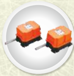
ROTARY LIMIT SWITCH