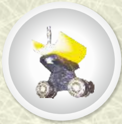
SQUARE TUBE TROLLEY