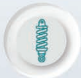
Swing Arm Rear Suspension