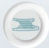
3D & Non-Slip Grids Floorboard