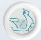
Ø305 mm Bottom Leg Space