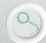
Chrome Finish Mirrors