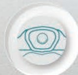
LED Head Lamp