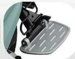
Rear Foot Rest