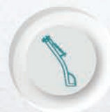
Side Stand Interlock