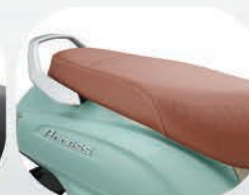
Seat Cover Brown