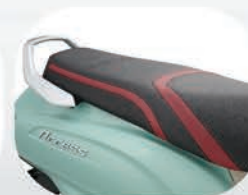
Seat Cover Maroon