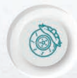
Front Disc Brake