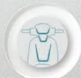
Iconic U-Shaped Design