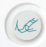
Highly Rigid Frame