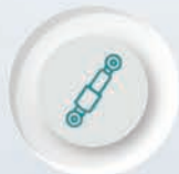
Telescopic Front Suspension