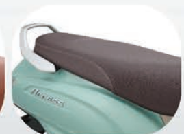
Seat Cover Dark Brown