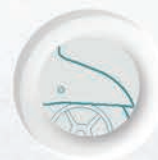
Steel Front Fender & Leg Shield