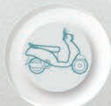
Classic Urban Styling