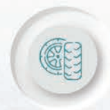
Low-Rolling Resistance Rear Tyre