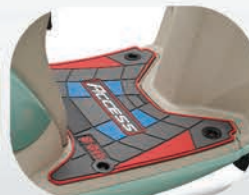
Floor Mat Red