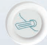
Aluminium Foot Rest