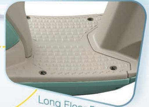
Long Floor Board