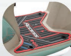
Floor Mat Black