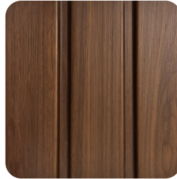
Foiled - Walnut