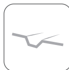
INCREASED PANEL STIFFNESS