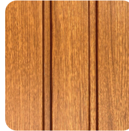
Foiled - Winchester Oak