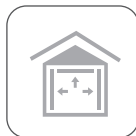
FOR INTERNAL USE ONLY