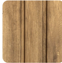
Foiled - Artisan Oak