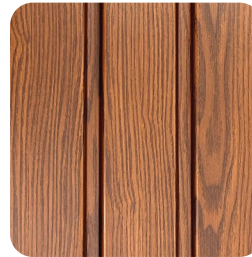
Foiled - Red Rosewood