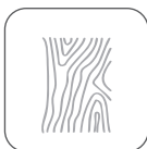
NATURAL WOODEN LOOK