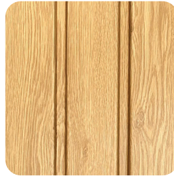
Foiled - Beige Oak