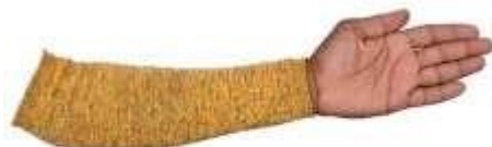
Single Layer Arm Cover