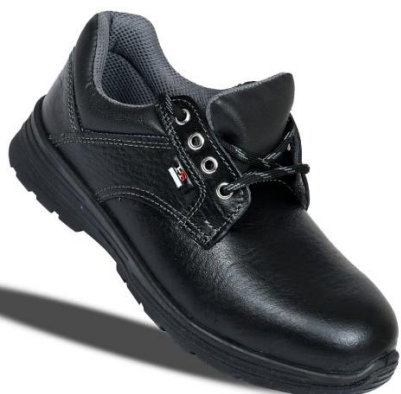
HS – 2451 DD