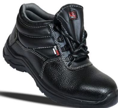
HS – ROCKERS SD