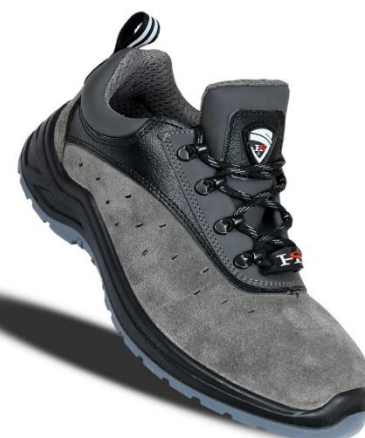
HS – 1001 DD