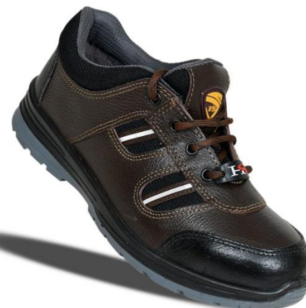
HS – 2602 DD