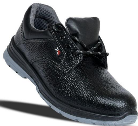
HS – 2453 DD