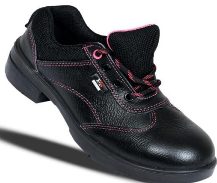
HS – 501 SD (LADIES)