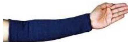
DOUBLE LAYER ARM COVER