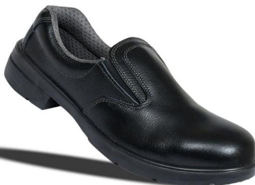
HS – 502 SD (LADIES)