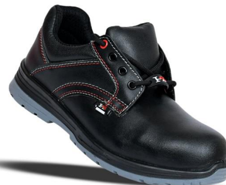
HS – 2610 DD