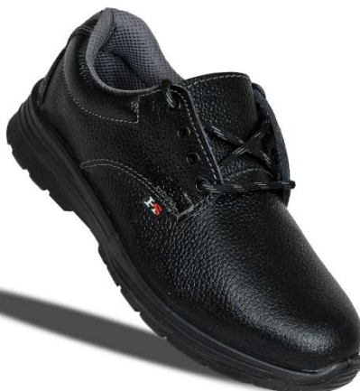
HS – 2205 SD