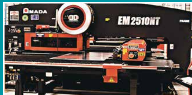
Panel Punching Machine