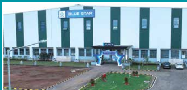
Wada – Deep Freezer Plant