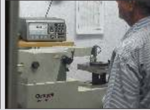
Horizontal Length M Mc