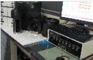
Cylinder Block Bore Gauging Station