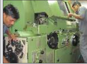
Internal Grinding Shop