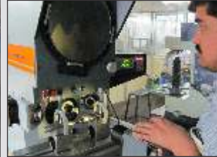
Digital Profile Projector