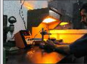
Plain Gauge Inspection