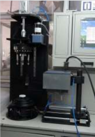
Brakedrum Gauging Station

Master Metrology manufactured multigauging stations as per customer requirement. Often, multiple parameters are required to be checked to reasonable accuracies and precision without fatigue. Our Multigauging sustems are designed taking the same into consideration. These are sophisticated measuring and segregating stations which are manufactured jointly with our techno-commercial partner M/S VGAGE of USA. These stations could be simple manual types, semi-sutomatic types aor fully automatic types.