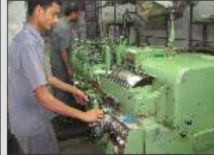
Thread Grinding Shop