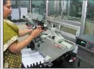
Carl Zeiss ULM