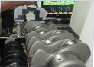
Crank-shaft Gauging Station