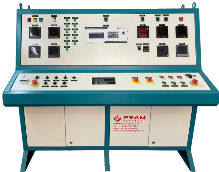
Transformer Testing Panel OC/SC Test, HV Test, DVDF Test