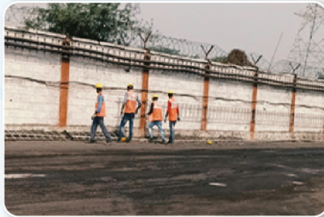
CABLE TRAY LAYING