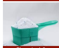
Chemical & Detergent