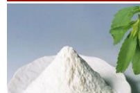
Agriculture & Fertilizer, Pesticides