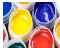
Paints & Colors