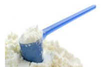
Coca & Milk Powder