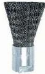
"WBA" HEAVY DUTY BRUSHES.