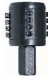
"EXP" EXPANDING BRUSH FOR THIN SCALE, SOOT OR SOFT DEPOSITS.