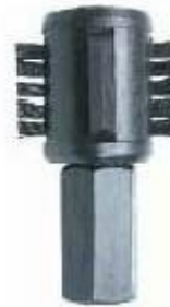
"EXS" EXPANDING SCRAPER FOR THIN SCALE, SOOT OR SOFT DEPOSITS.