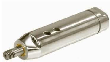
3000 Series ADTC 3000 Series ADTC