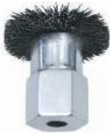
"TH" FOR SOOT REMOVAL FROM SMOKE TUBES, GENERAL CLEANING.