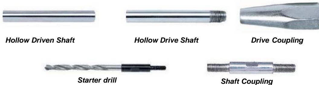
Hollow Driven Shaft