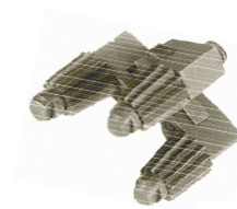
SC Cutter Head