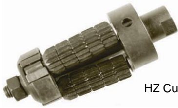
HZ Cutter Head