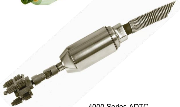
4000 Series ADTC