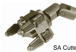
SA Cutter Head