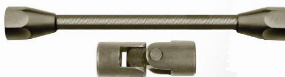
Universal Joint & Flexible Holder