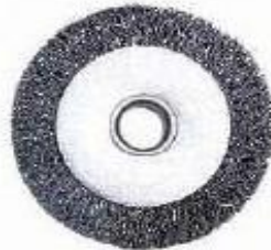
"CB" SPARE BRUSH WHEELS FOR "MB" BRUSHES.