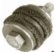
B Type Brush

This tool is commonly used for thin but hard scale.