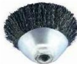
"RS" HEAVY DUTY BRUSHES FOR HEAVY SCALE REMOVAL.