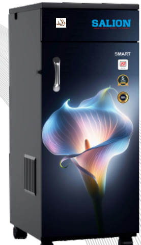
S - 4