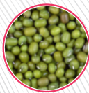
Moong 20 Kg