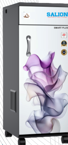
SPT - 2