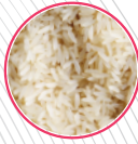
Rice 5 to 7 Kg