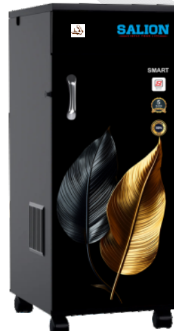
S - 3