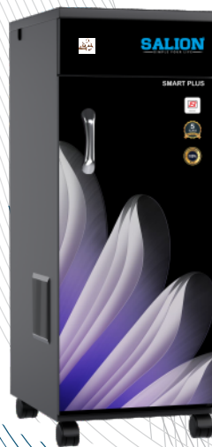
SP - 2