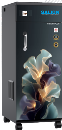
SP - 1