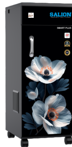
SPT - 3