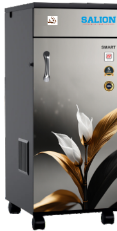
ST - 2