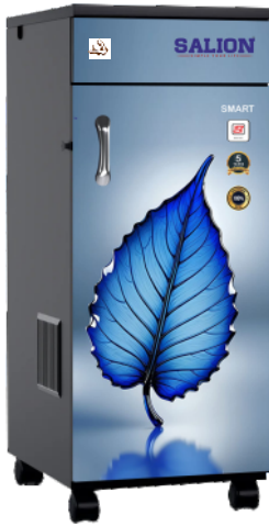
S - 1