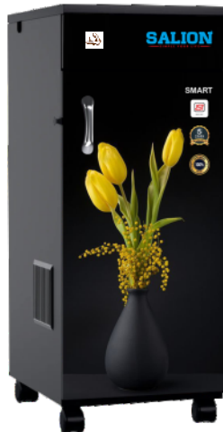
S - 2