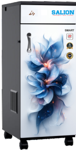
ST - 1