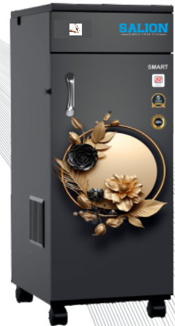
ST - 4