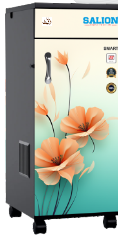
ST - 3