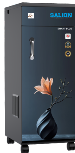
SP - 3