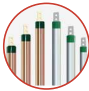
Copper GI Earthing