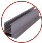
Aluminium Micro Rail