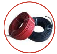
AC - DC WIRE