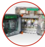
Solar Acdb & dcdb