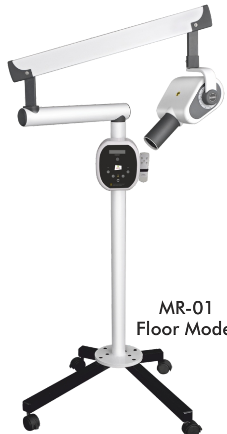
MR-01 Floor Model