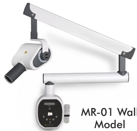
MR-01 Wall Model