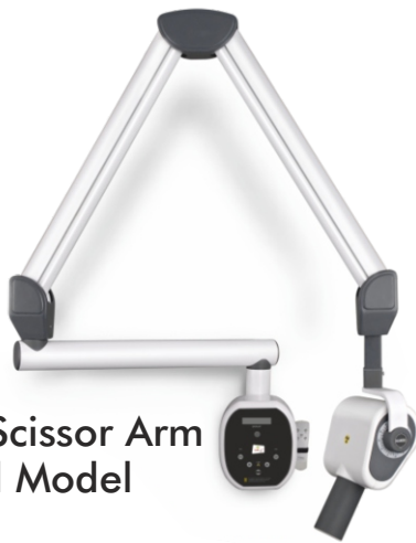
MR-01 Scissor Arm Wall Model