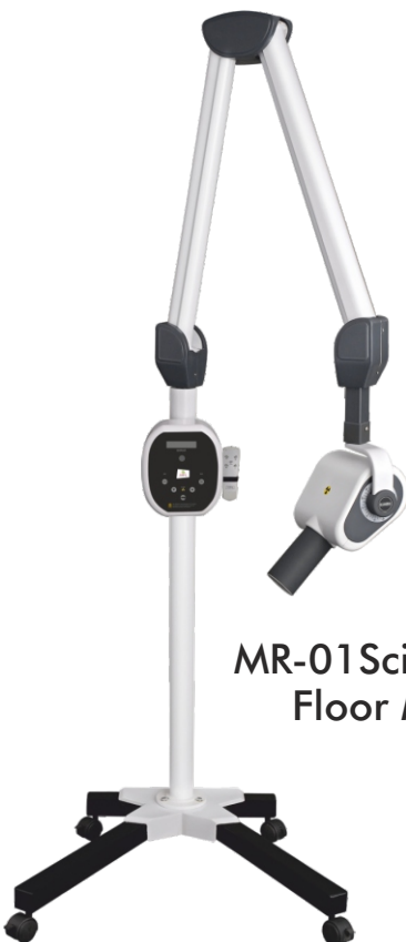
MR-01 Scissor Arm Floor Model