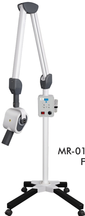
MR-01/60 Scissor Arm Floor Model