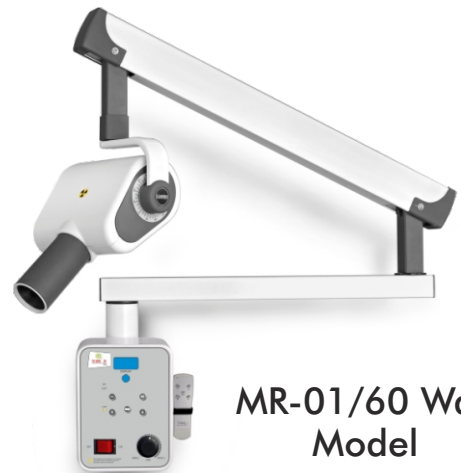
MR-01/60 Wall Model