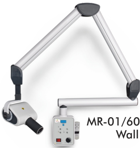
MR-01/60 Scissor Arm Wall Model