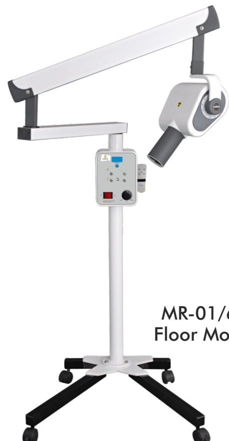
MR-01/60 Floor Model