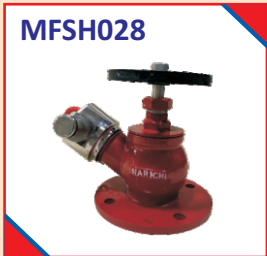
Hydrant Valve Commercial 160 / 145 PCD