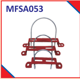
Rizer Support Size : 2", 3", 4" & 6"