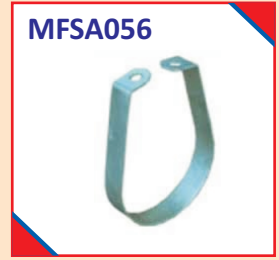
Patti Clamp Size : 1" to 6"