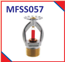
Pendent Sprinklers Zinc Alloy / Brass