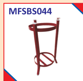
Extinguisher Floor Stands ABC 2,4,6,9 Kg. & CO 2 2 & 4.5 Kg.