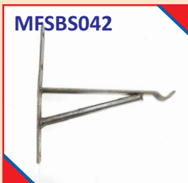
Fire Bucket Stand Single