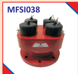
Four Way Inlet