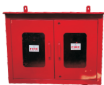
Double Door Hose Box Size : (750 X 600 X 250) mm (22, 20, 18, 16) SWG