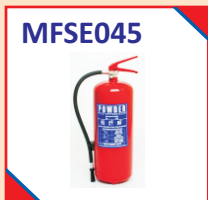
ABC Type 1 / 2 / 4 / 6 / 9 Kg.