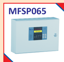
Fire Alarm Panel 2 / 4 / 6 / 8 Zone