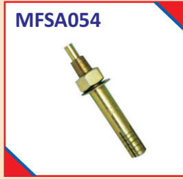
Anchor Fastner Size : 12 X 100 mm