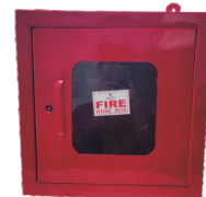
Single Door Hose Box Compact Size : (400 X 400 X 200) mm (22) SWG