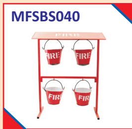
Fire 4 Bucket Stand / Set