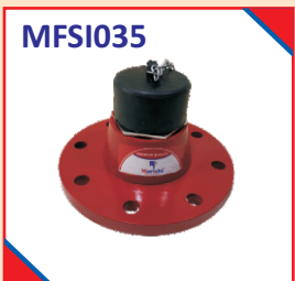
One Way Inlet