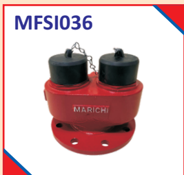
Two Way Inlet