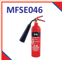
CO 2 Type 2 / 4.5 Kg.