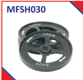
Hydrant Valve Wheel