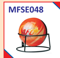
Fire Ball 1.3 Kg.