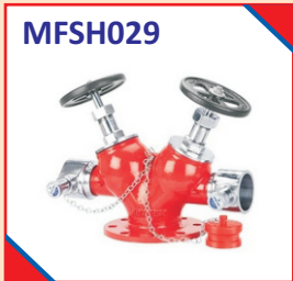
Double Outlet Hydrant Valve (ISI & Non ISI) SS / GM