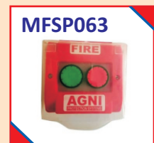
ON / OFF SWITCH