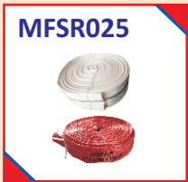
RRL Hose Pipe Type A / B