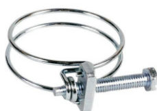
Wire Clamp Size : 1" & 3/4"