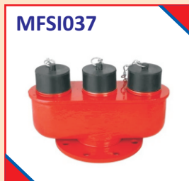
Three Way Inlet