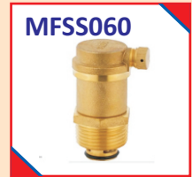
Air release Valve