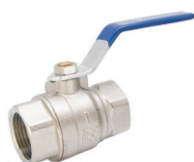
Ball Valve (SS / Brass) Size : 1" & 3/4"