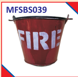
Fire Bucket (7 / 9 Ltrs)