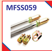
Flexible Sprinklers Droplet Pipe