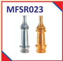
Short Branch Pipe SS / Aluminum / Brass ISI / Non ISI