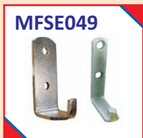
Fire Ext. Clamps ABC / CO 2