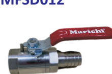
Ball Valve With Hose Collar Size : 1" SS