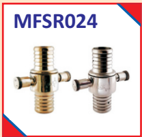
Male Female Coupling SS / Aluminum / Brass ISI / Non ISI