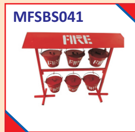
Fire 6 Bucket Stand / Set