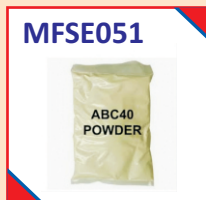
Fire Ext. Powder ISI / Commercial