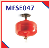
Modular Type ABC Type 2 / 5 Kg.