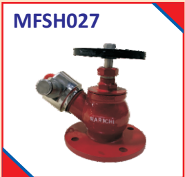
ISI Hydrant Valve SS / GM