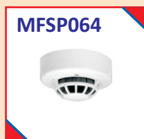
SMOKE / HEAT Detector