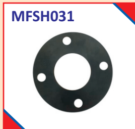
Rubber Flange Gasket