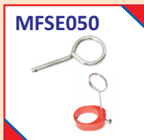
Lock Pin ABC / CO 2