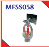
Sidewall Sprinklers Zinc Alloy / Brass