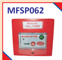
MCP (Manual Call Point)