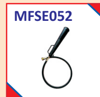
Fire Ext. CO 2 Horn With Pipe