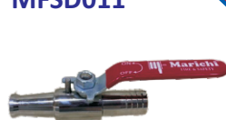
Shut Off Nozzle (SS / Brass) Size : 1" & 3/4"