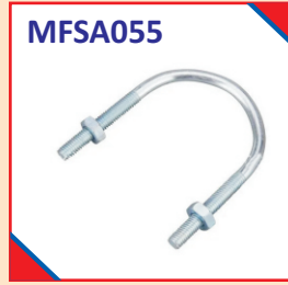
U Clamp Size : 2", 3", 4" & 6"