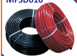
Hose Reel Pipe (1" & 3/4") Thermoplastic / PVC (Heavy / Medium / Lite)