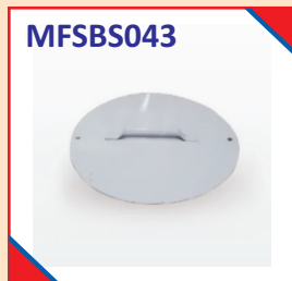
Fire Bucket Cap