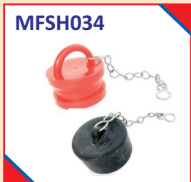
Red Cap / Black Cap