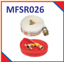
RRL Hose Pipe With Coupling (Type A / B) SS / Aluminum / Brass