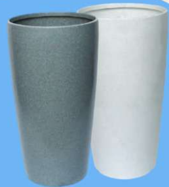
Gleyz Vertical Tall