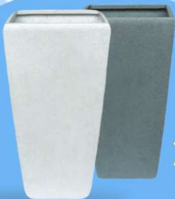
Gleyz Cube Tall