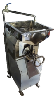
Instant Rice Grinder