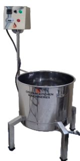
Poultry Scalding Tank