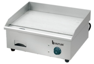
Electric Hot Plate