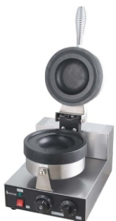
Gelato Panini Grill