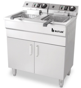
Floor Standing Fryer