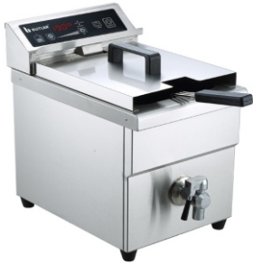
Induction Deep Fryer