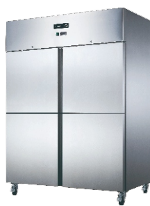
Reach In Freezer