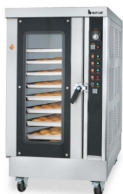
Convection with Steam