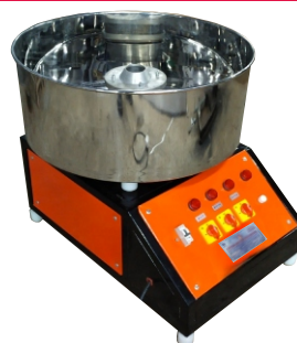
Cotton Candy Machine