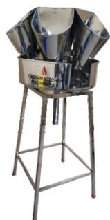
Poultry Killing Cone