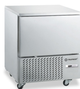
Blast Chiller / Freezer