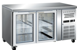
Refrigerated Work Table