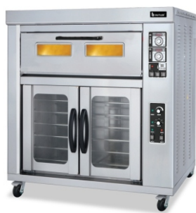
Oven cum Proofer