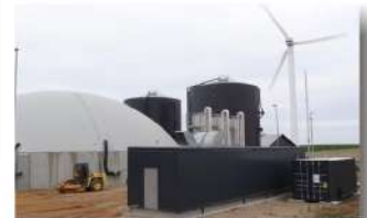
Wind Mill & Biogas