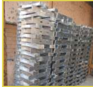
CABLE TRAY BRACKETS