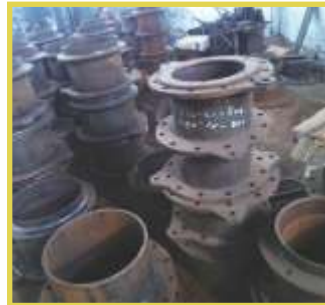
INLET & OUTLET ADOPTER