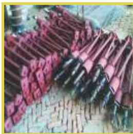
Ms Pipe Type