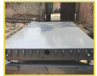
Dock Leveler Lifter