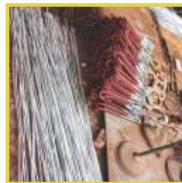
Ms Sag Rods