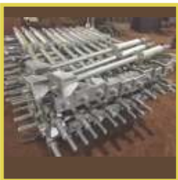
GI Pipe Foundation Bolt