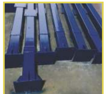
SQ. PIPE STRUCTURE