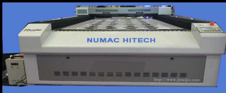
MODEL - NH1325

WELCOME TO NUMAC HITECH Thank you for interest shown. The catalogue describes features needs for CNC laser Engraving & cutting machines. We are offering an excellent quality of laser CNC Machine Engravers & Cutting machines of wide range to our clients. These laser CNC machines, offered by us, are made from very high quality raw materials & components. This ensures high standard of performance and long life. These laser CNC machine are in high demand in the market & They are indispensable for quality and repetitive accuracy. Machines are available in various Models to meet different application & size.