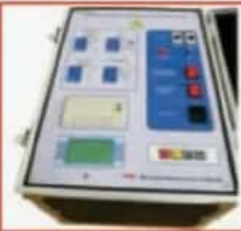
Fully Automatic Capacitance Tan Delta Test Set with Printer, Model: CTD-10