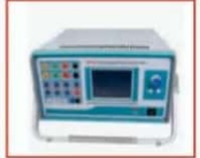
Three Phase Automatic Relay Test Set