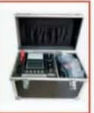
Automatic Contact Resistance Tester with Printer, 100 Amps