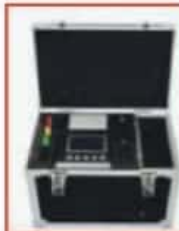
Fully Automatic Winding Resistance Tester