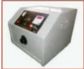
Transformer BDV Oil Test Set