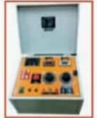
Single Phase Relay Test Set