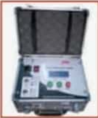
Circuit Breaker Timer