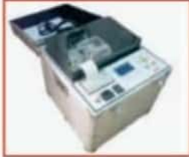
Fully Automatic Transformer BDV Oil Test set with Printer