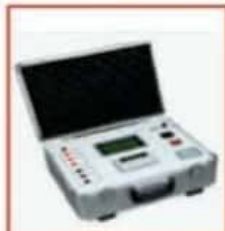
Automatic Transformer Turns Ratio Tester with Printer, Measurement Ratio: 0-10000