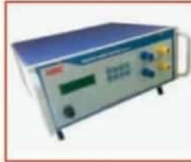
Contact Resistance Tester, 10 Amps