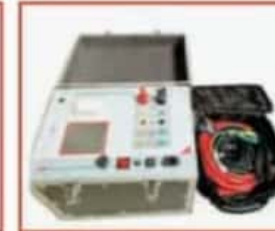
Fully Automatic CT PT Analyzer with Printer