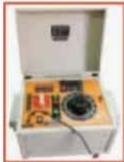
Primary Current Injection Kit