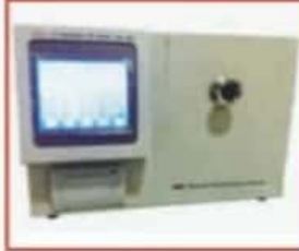
Automatic Transformer Oil Acidity Tester with Printer