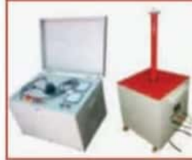
AC/DC High Voltage Tester