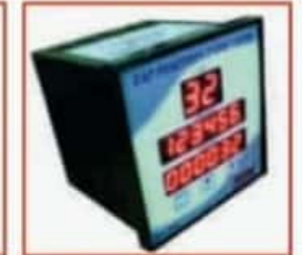
Digital Tap Position Indicator With Voltage and Counter