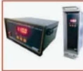
Automatic Voltage Regulating Relay