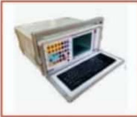
Fully Automatic Nimerical Relay Test Set with in-built Computer