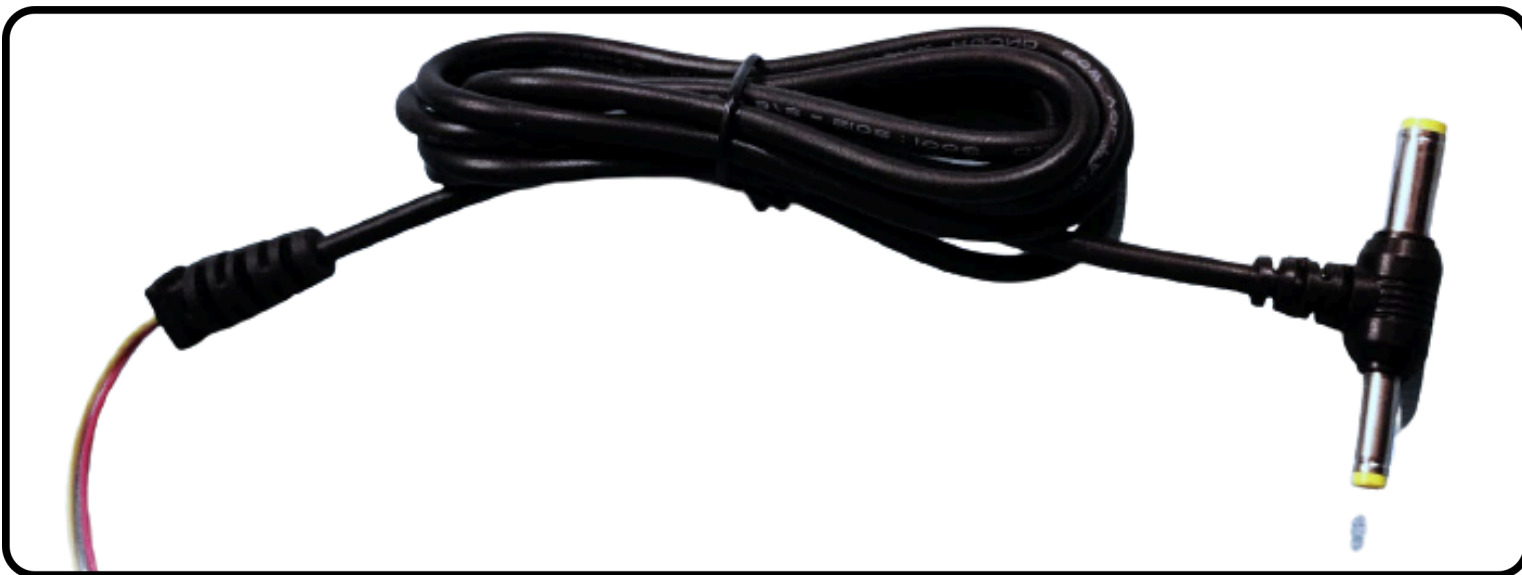
DC+SONY ADAPTER LEAD ROUND WIRE CODE NO :- DSARRE02