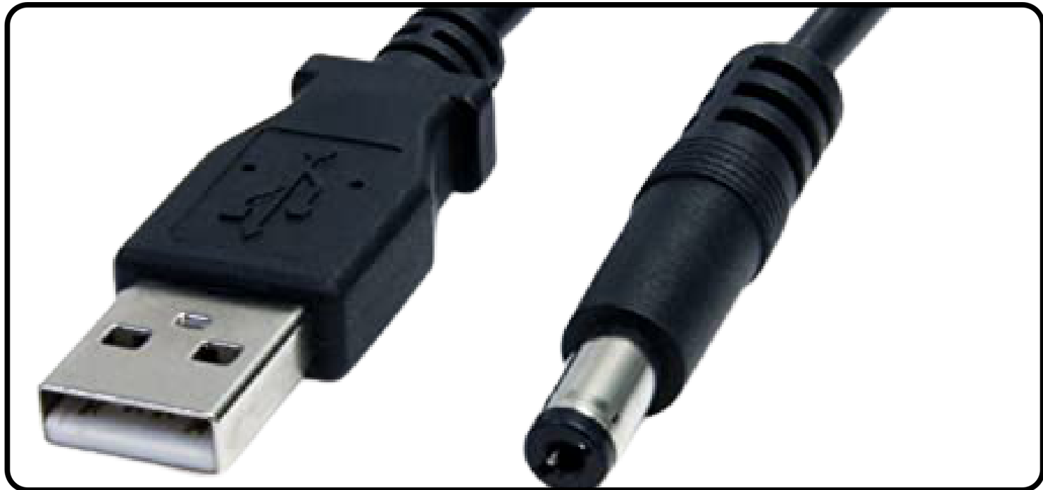
DC TO USB LEAD CODE NO :- DURE20