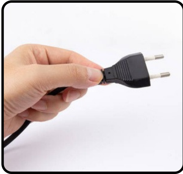
TWO PIN POWER CORD CODE NO :- TPCRE11 AVAILABLE IN VARIOUS LENGTH (LIKE 1M , 2M ETC)