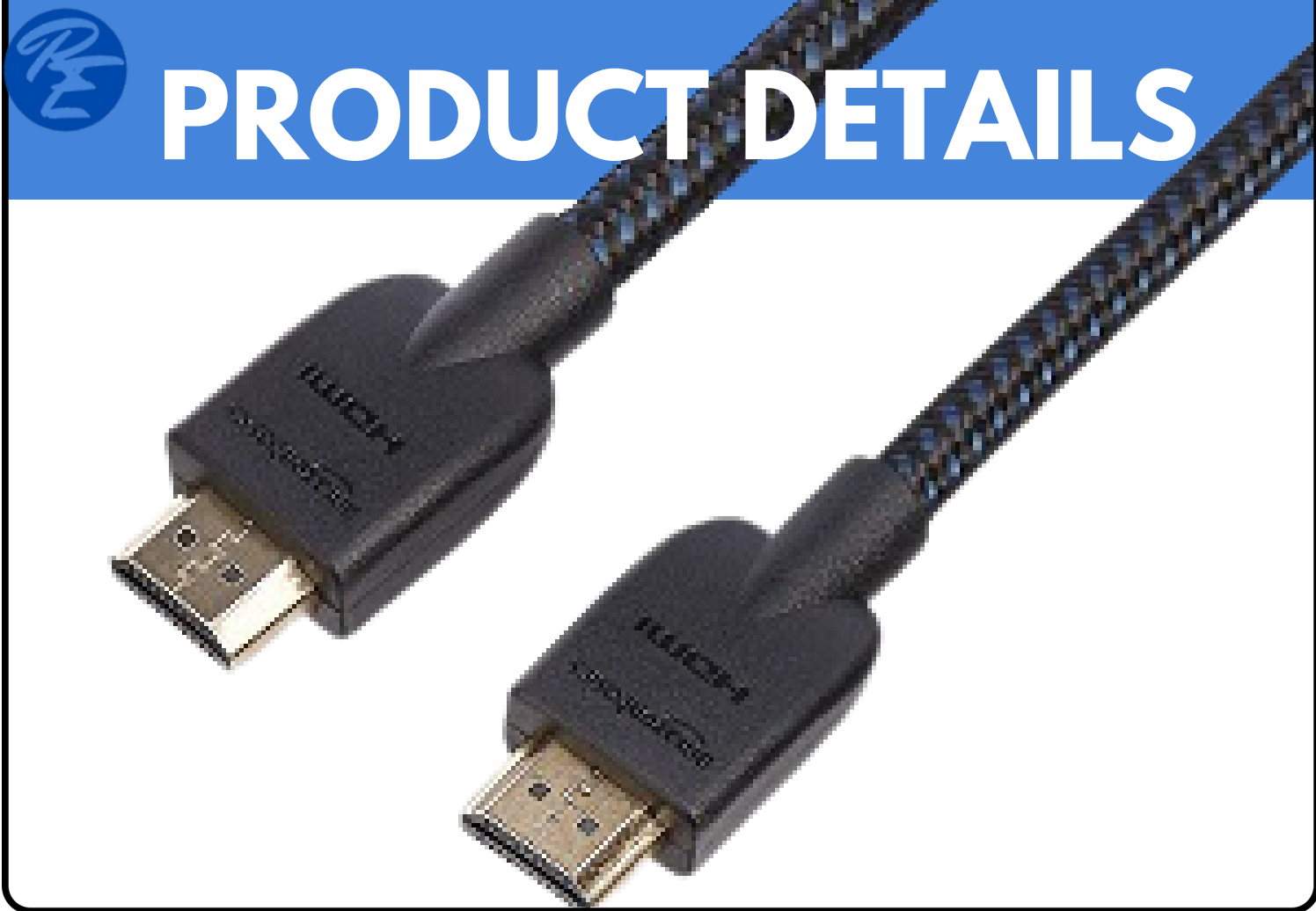
TYPE-C TO TYPE-C LEAD CODE NO :- TTCRE19