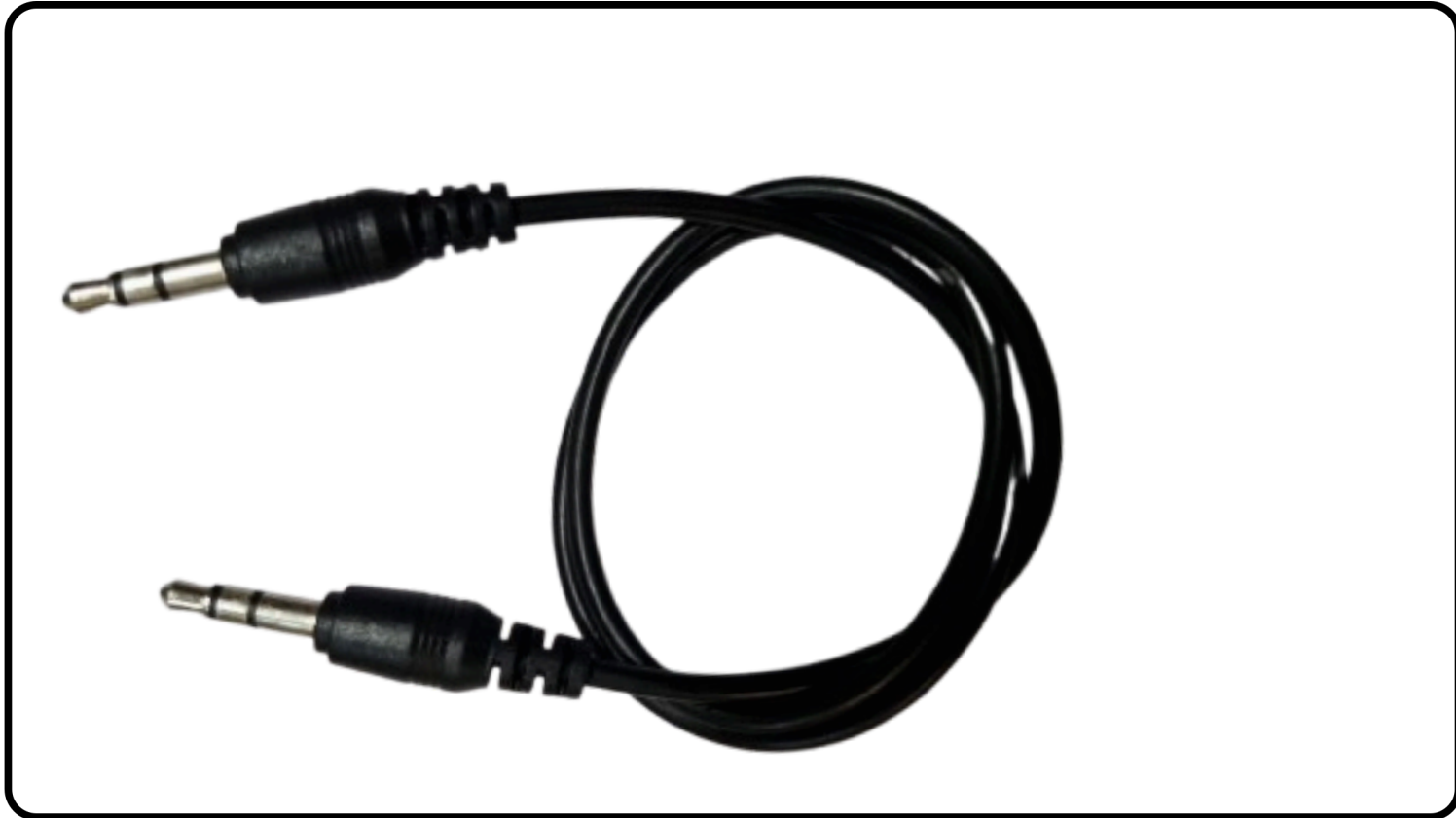
AUX TO AUX AUDIO CABLE CODE NO :- ATARE05