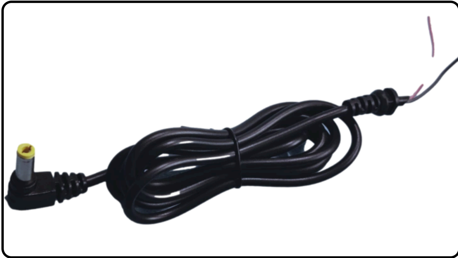
DC 2.1 ADAPTER LEAD L TYPE ROUND WIRE CODE NO :- D2.1ALRE03