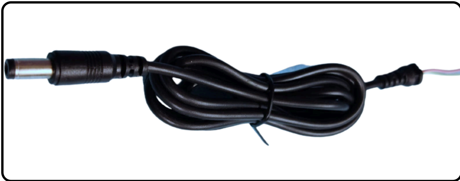
DC 2.5 ADAPTER LEAD ROUND WIRE CODE NO :- D2.5ASRE04