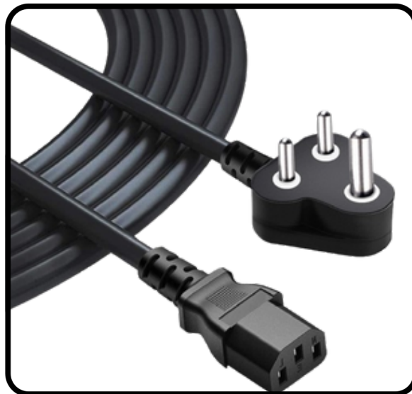
AC POWER CORD CODE NO :- APCRE13 AVAILABLE IN VARIOUS LENGTH (LIKE 1M , 2M ETC)