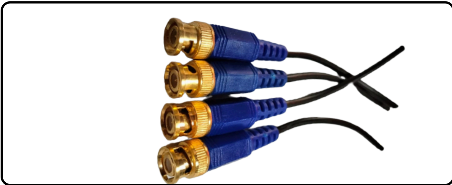
BNC CABLE CODE NO :- BNCRE06