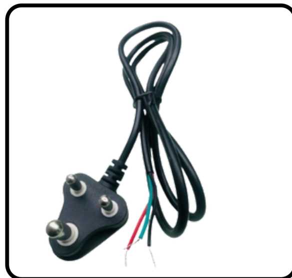
3 PIN POWER CABLE CODE NO :- 3PCRE14 AVAILABLE IN VARIOUS LENGTH (LIKE 1M , 2M ETC)