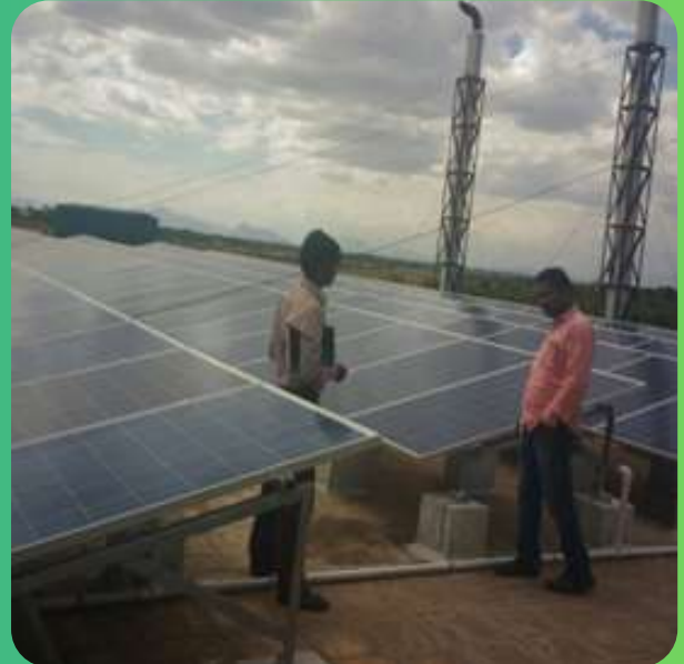
AIRPORT MADURAI 1.2 MW