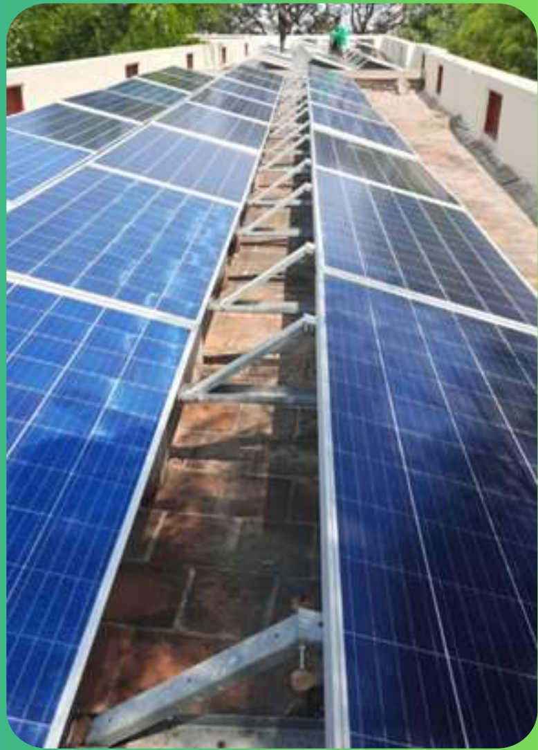
THIAGARAJA ARTS COLLEGE 600 KW