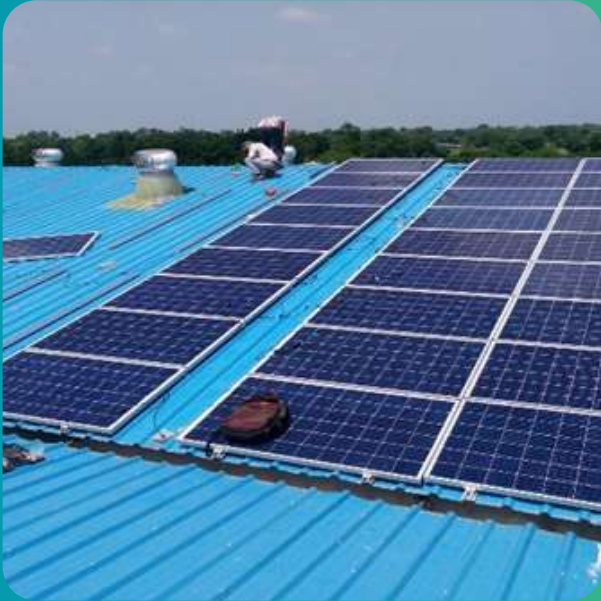
ROOF TOP SOLAR