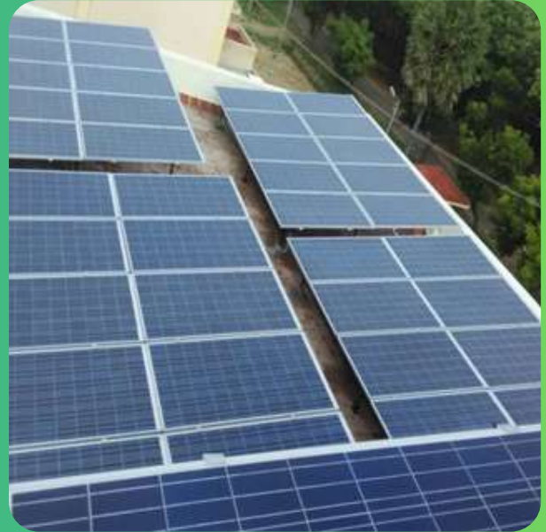
HOSPITAL SALEM 30 KW