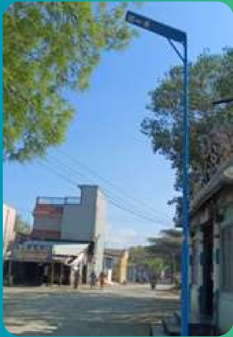
SOLAR STREET LIGHT ALL IN ONE