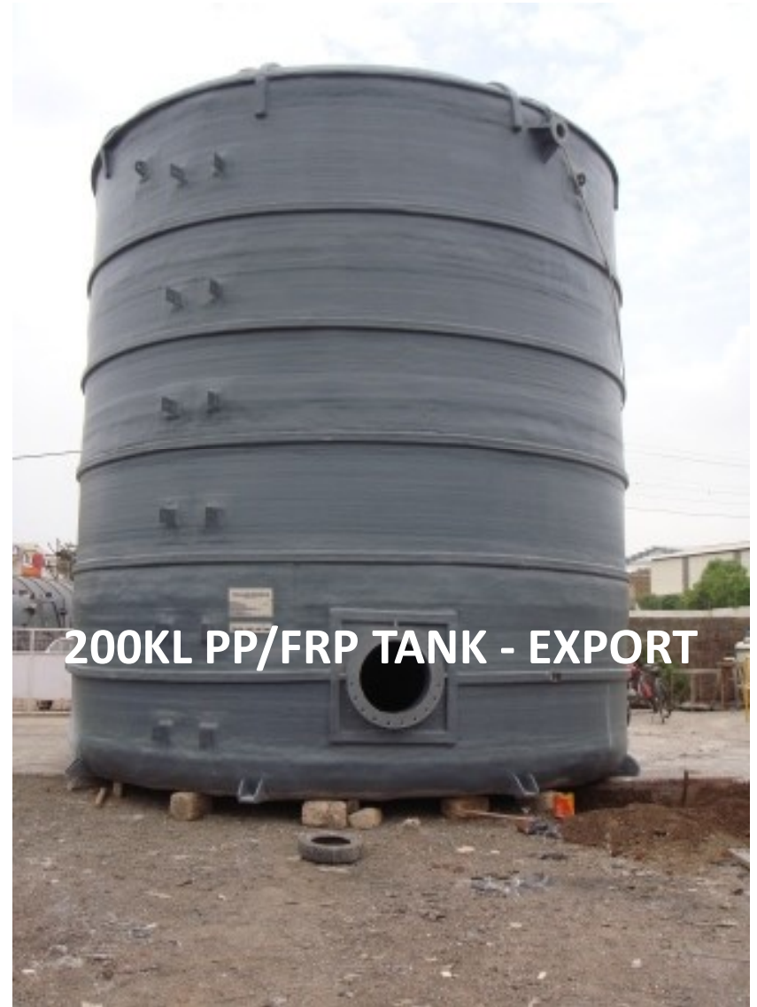
200KL PP/FRP TANK - EXPORT