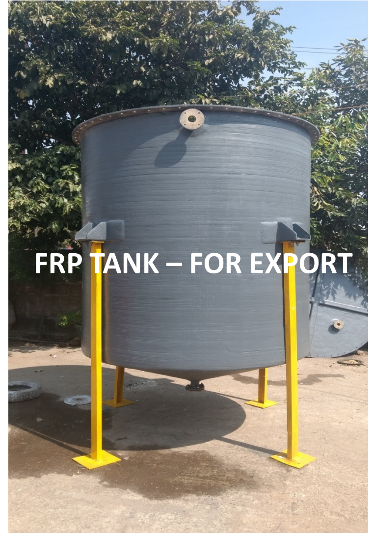
FRP TANK – FOR EXPORT