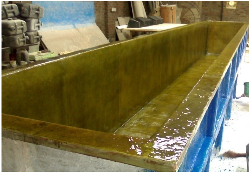
FRP PICKING TANK