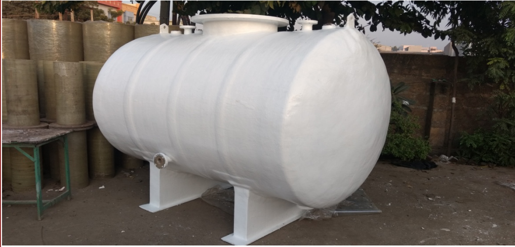
FRP TANK – FOR JET FUEL STORAGE – FOR US ARMY