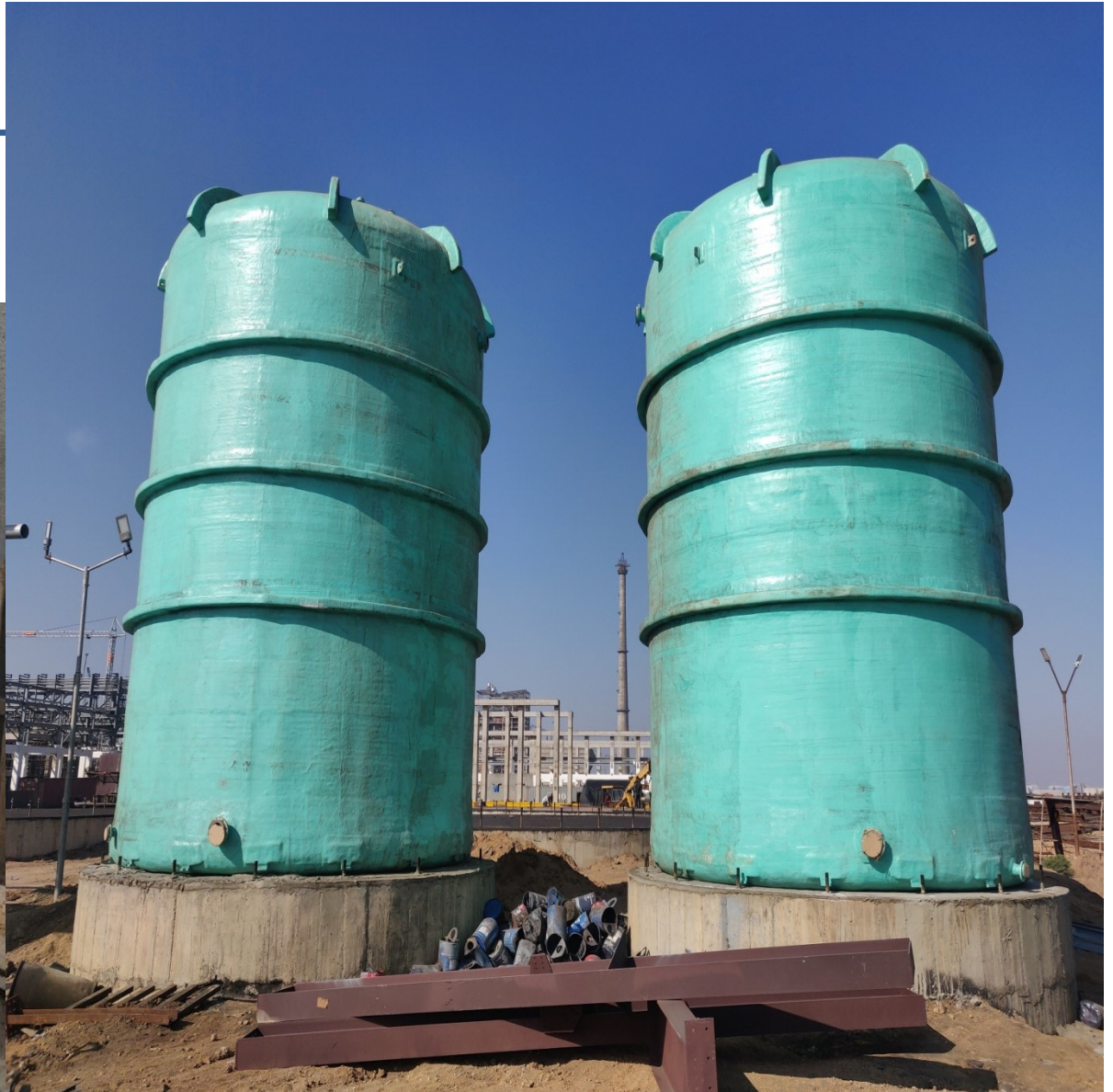
CPVC/FRP – 150M3 HYPO STORAGE TANK