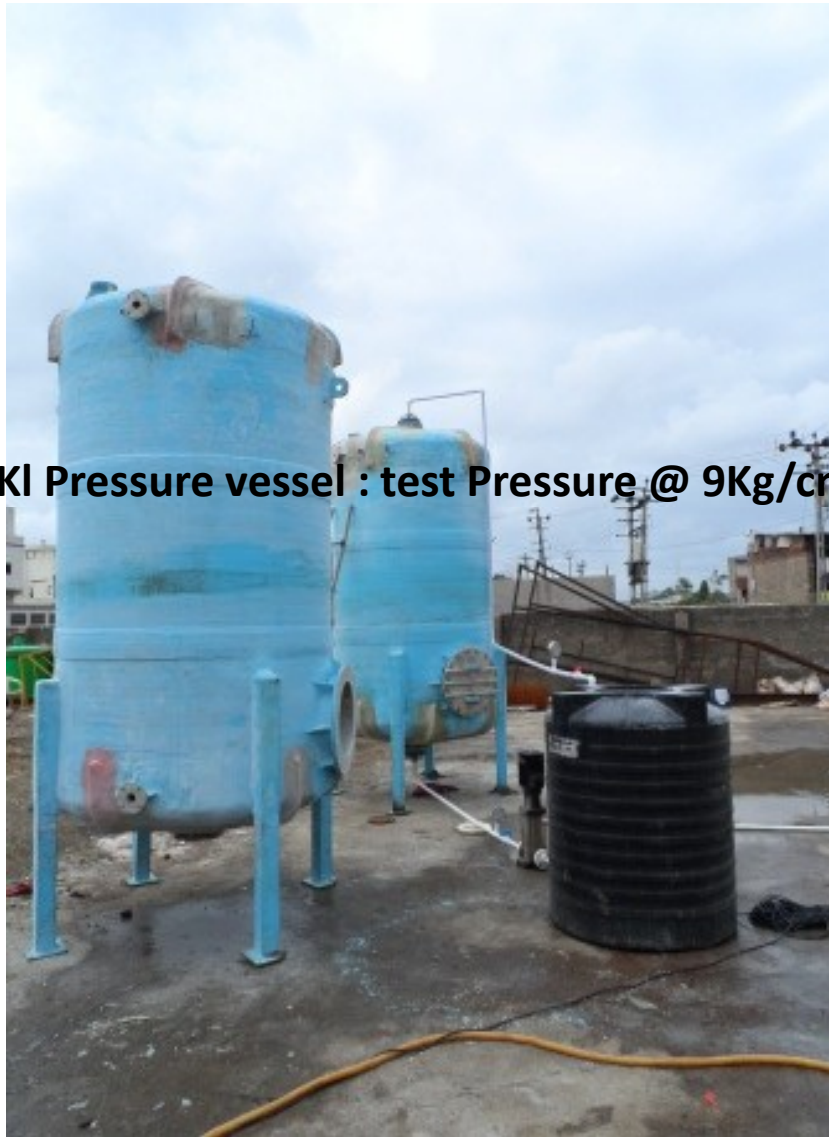
7KL Pressure vessel : test Pressure @ 9Kg/cm 2