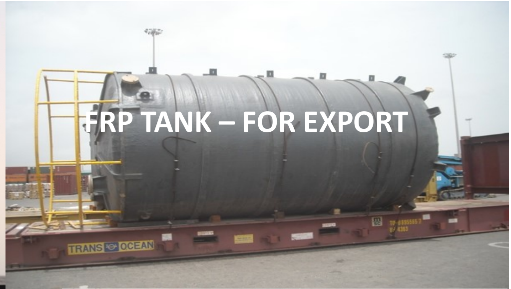
FRP TANK – FOR EXPORT