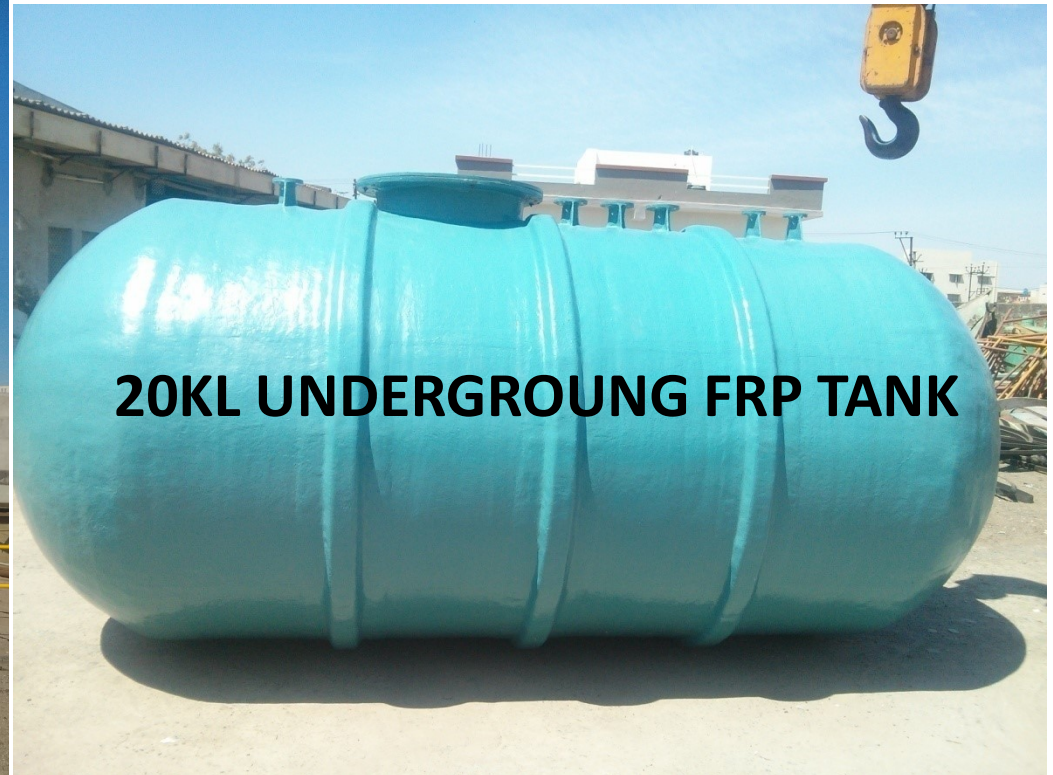
20KL UNDERGROUND FRP TANK