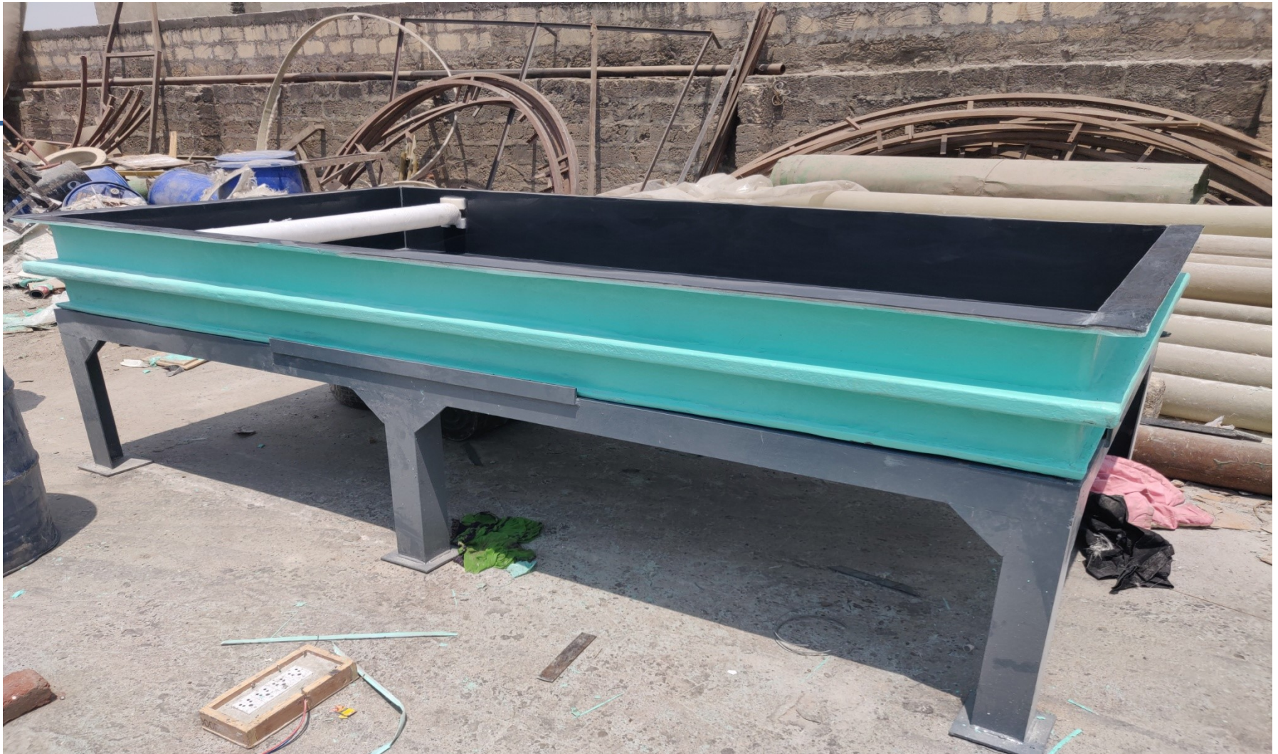
CPVC/FRP – MEMBRANE BATH