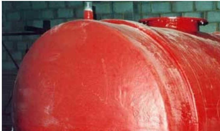
Horizontal FRP Tank