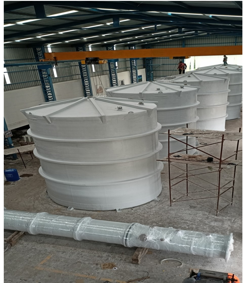
100m3 - Capacity