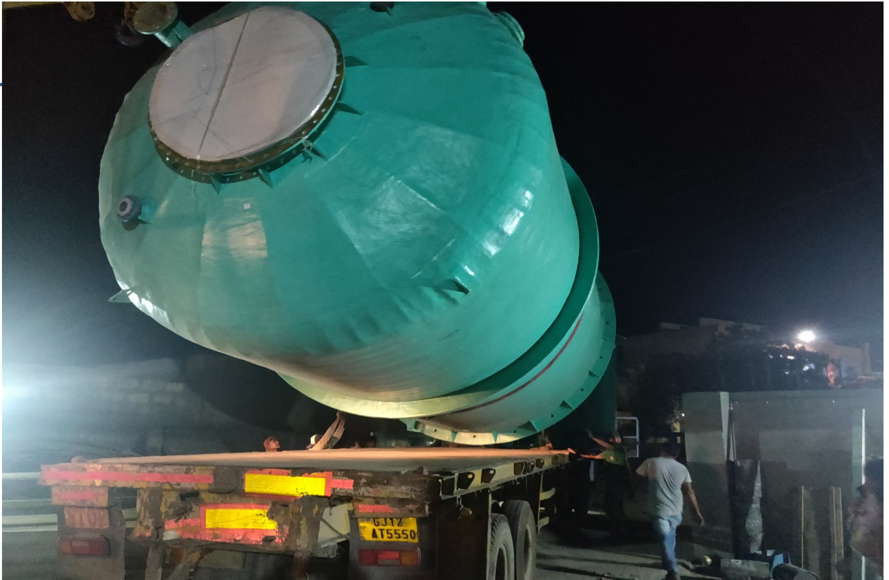
CPVC/FRP – SUCTION TANK – 60M3