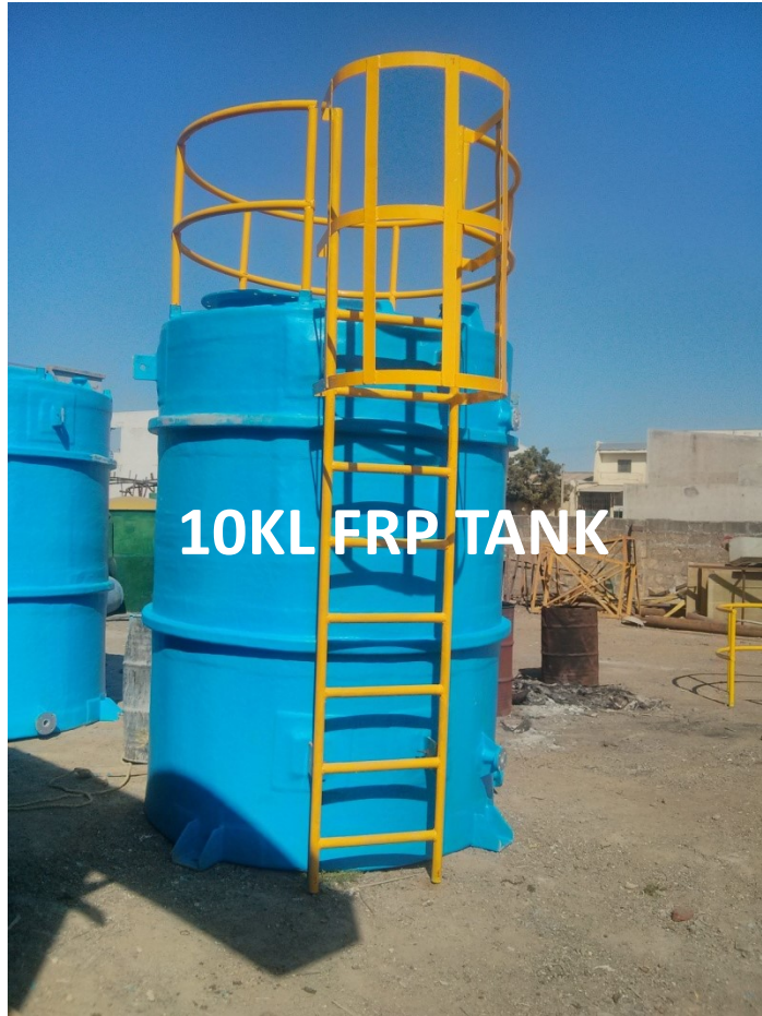
10KL FRP TANK