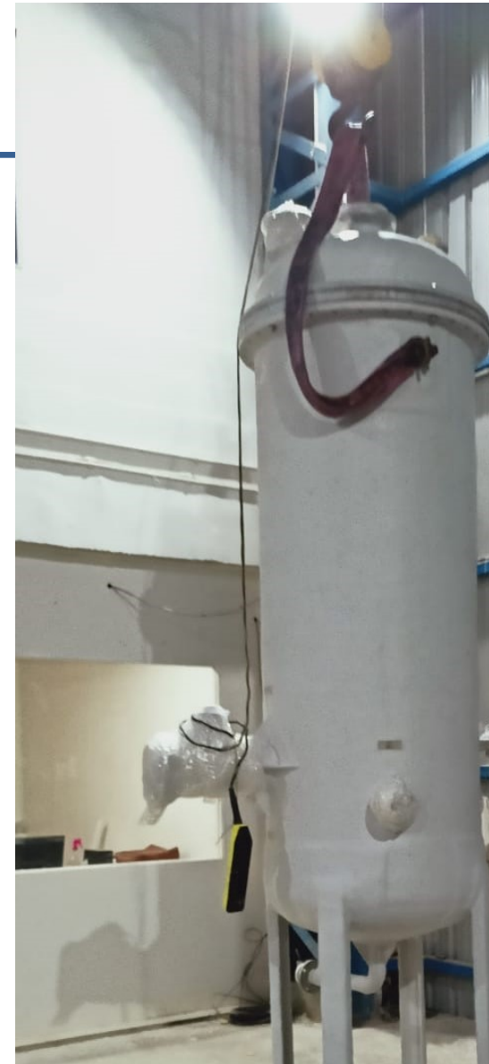
Wet Chlorine Filter