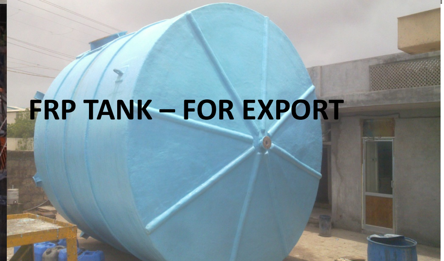
FRP TANK – FOR EXPORT