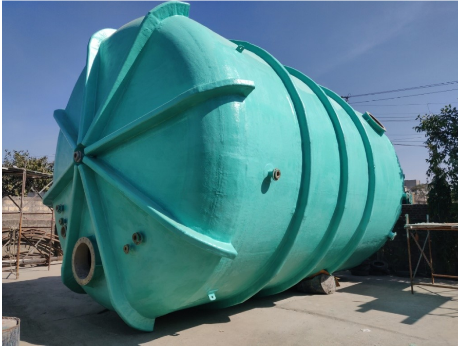
150m3 - Capacity