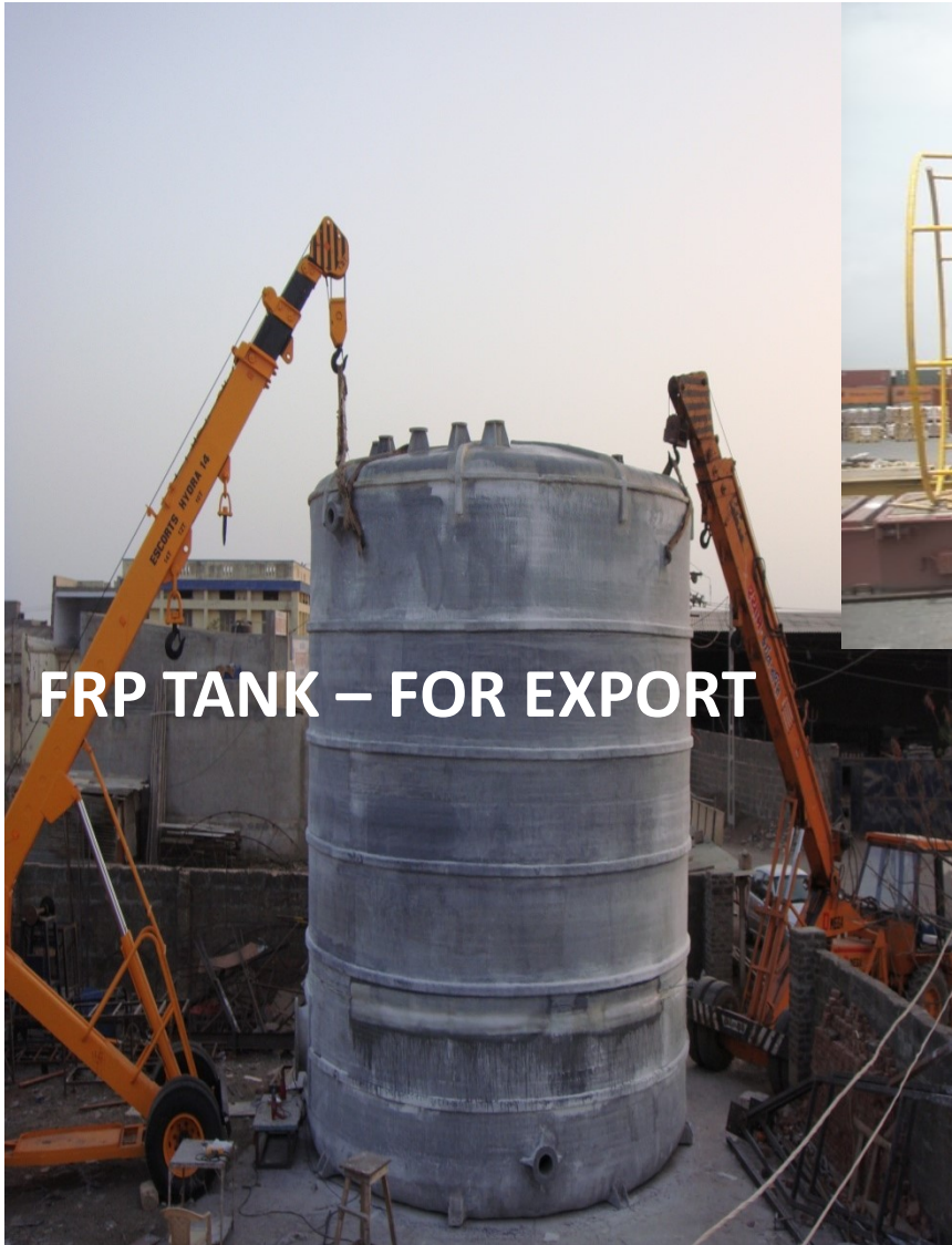
FRP TANK – FOR EXPORT