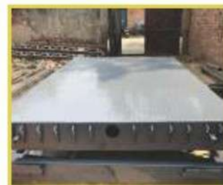
Dock Leveler Lifter