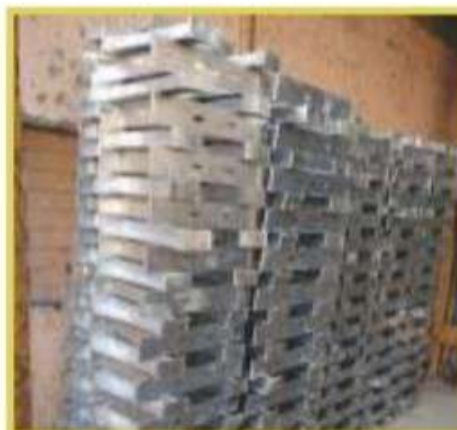
CABLE TRAY BRACKETS