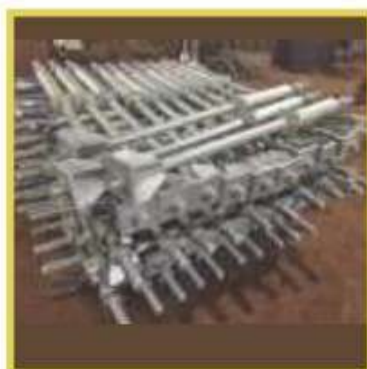
GI Pipe Foundation Bolt