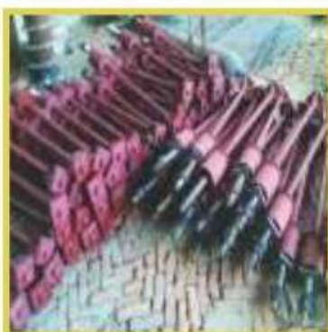
Ms Pipe Type