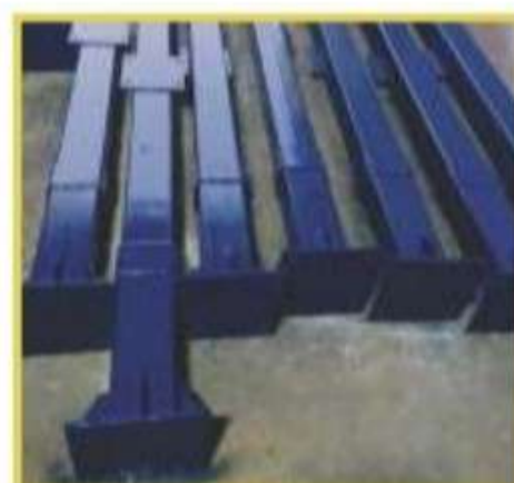
SQ. PIPE STRUCTURE