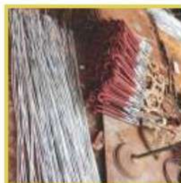
Ms Sag Rods