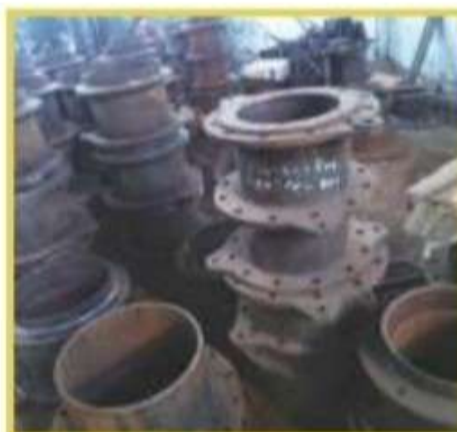
INLET & OUTLET ADOPTER