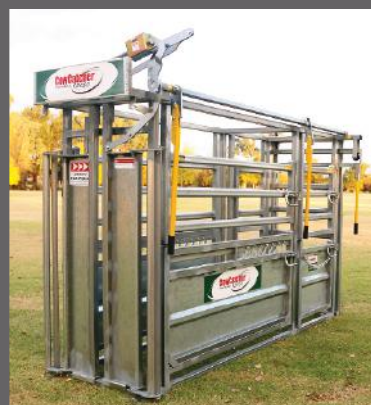
LIVE STOCK HANDLING PARTS