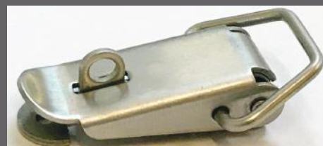
AUTOMOTIVE LOCK ASSEMBLY