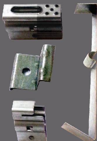
SOLAR MOUNTING PARTS