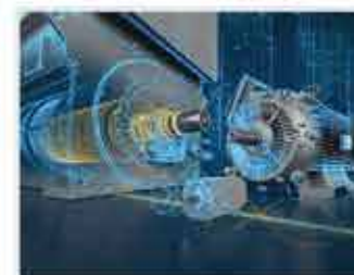
PUMPS & MOTORS INDUSTRIES