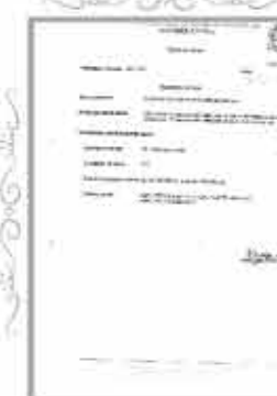
CPRI-SHORT CIRCUIT 70KA