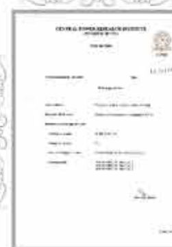
OPRI-SHORT CIRCUIT 50KA